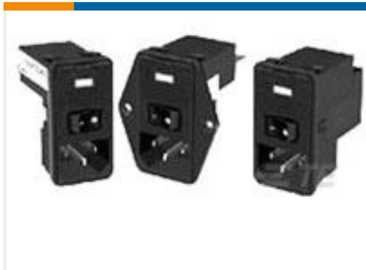
TE Part #3-6609107-5 PS0SXSSX0=C1081