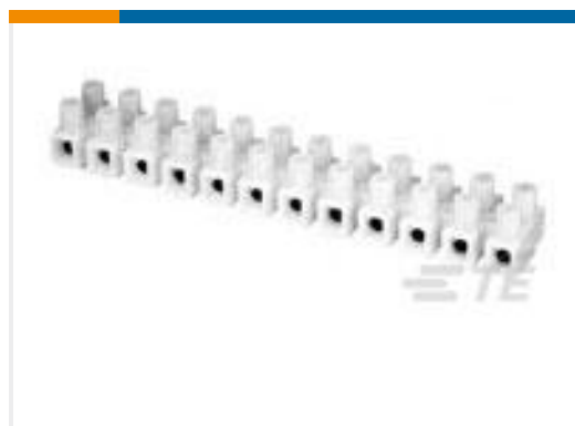
TE Part #1776296-5 TSB5000531DS=EUROPA T-BLK,10MM