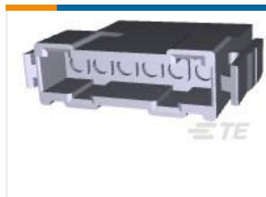
TE Part #207376-1 HSG,RECEPT 6 POSN,METRIMATE