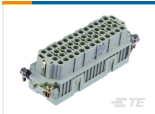
TE Part #T2050462201-000 HEE-046-F