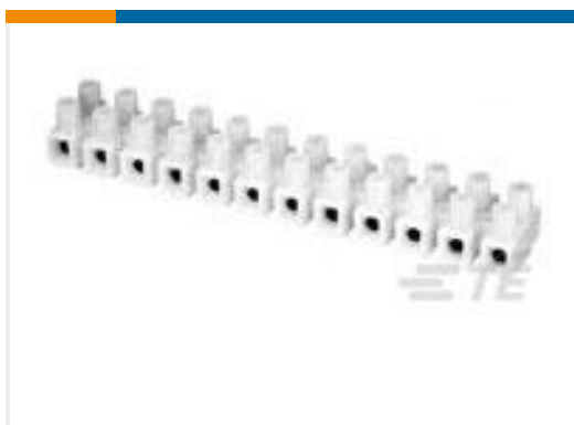
TE Part #1776296-4 TSB5000431DS=EUROPA T-BLK,10MM