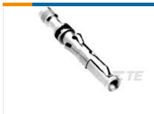
TE Part #207896-1 CONTACT SOC. ASSY.