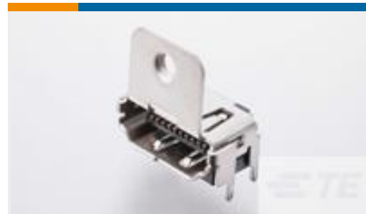
TE Part #2013978-1 Mini HDMI, RA, SMT