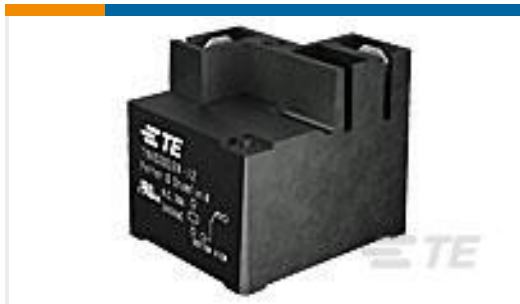
TE Part #1-1393210-3 T9AS1D12-12