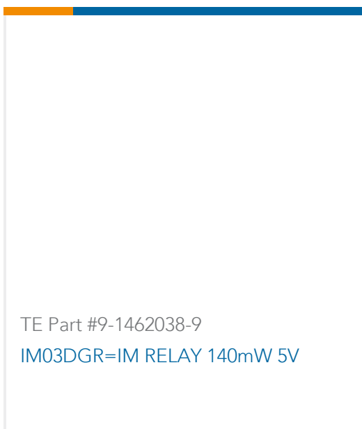
TE Part #9-1462038-9 IM03DGR=IM RELAY 140mW 5V