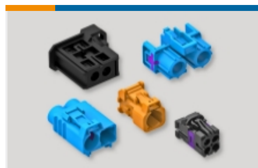
Data Connectivity Housings(3)