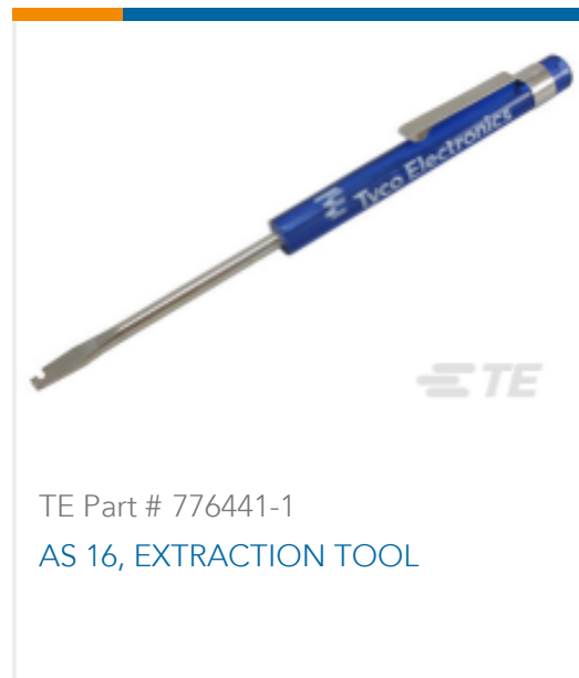
TE Part # 776441-1 AS 16, EXTRACTION TOOL