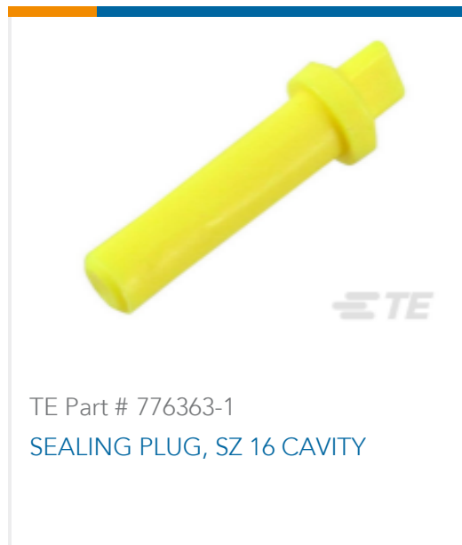
TE Part # 776363-1 SEALING PLUG, SZ 16 CAVITY