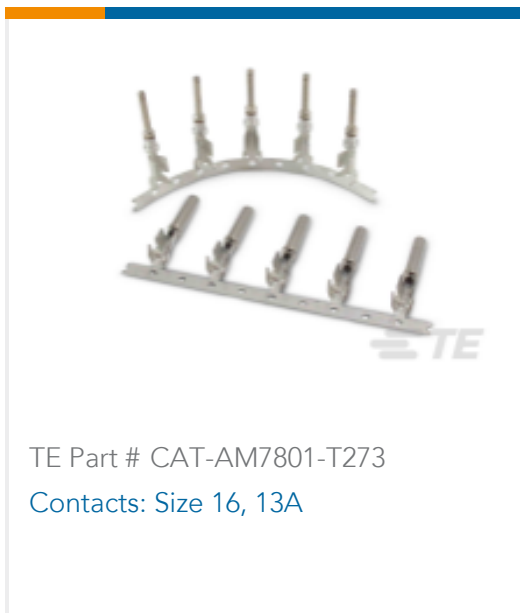
TE Part # CAT-AM7801-T273 Contacts: Size 16, 13A