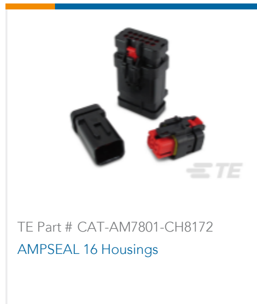
TE Part # CAT-AM7801-CH8172 AMPSEAL 16 Housings