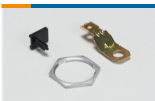
Other Automotive Connector Accessories(11)