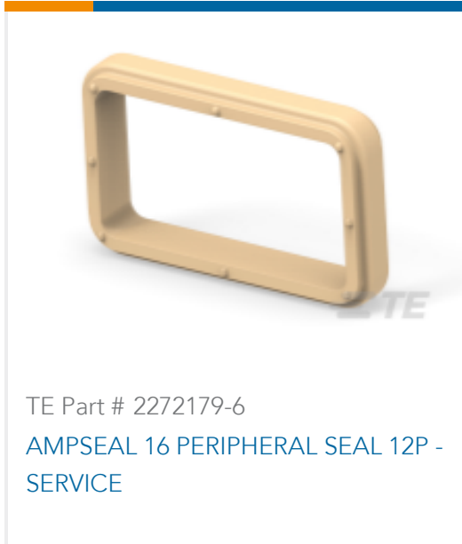
TE Part # 2272179-6 AMPSEAL 16 PERIPHERAL SEAL 12P - SERVICE