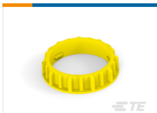
TE Part #2350943-1 FIX RING, CONN KIT