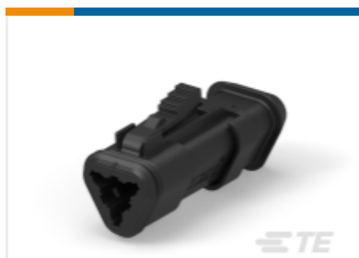
TE Part #2-2600027-8 3CCT BLACK PLUG W/LARGE SEAL & HS