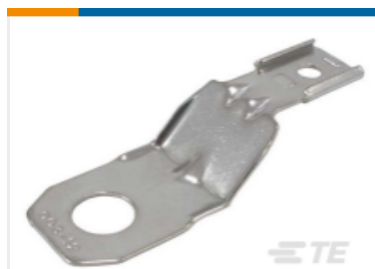
TE Part #1027-003-1200 CLIP, SS, 11MM HOLE, ST