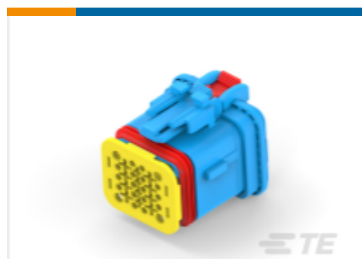
TE Part #2350890-4 20POS, HYBRID, SOC HSG ASSY, SLD, COD D