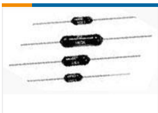
TE Part #8-1879627-6 H4P 36K 1% 100PPM