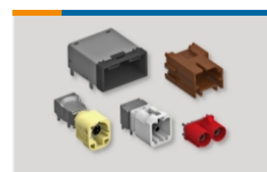
Data Connectivity Headers(2)