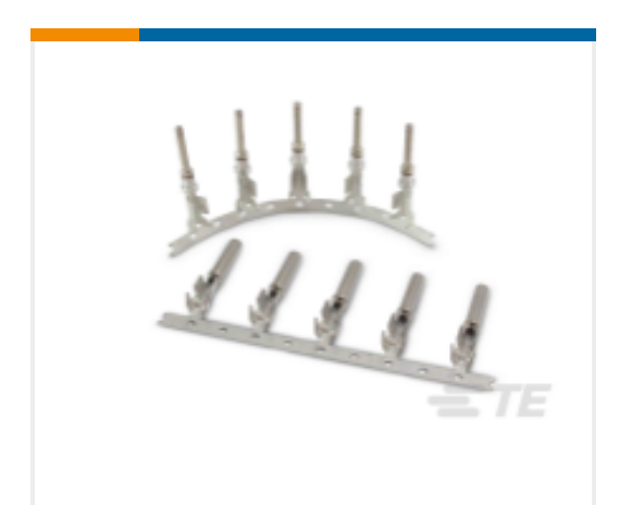
TE Part # CAT-AM7801-T273 Contacts: Size 16, 13A