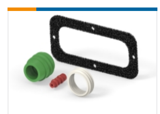
Connector Seals & Cavity Plugs(4)