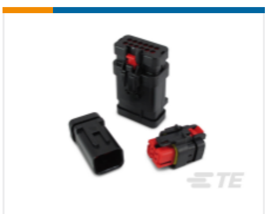
TE Part # CAT-AM7801-CH8172 AMPSEAL 16 Housings