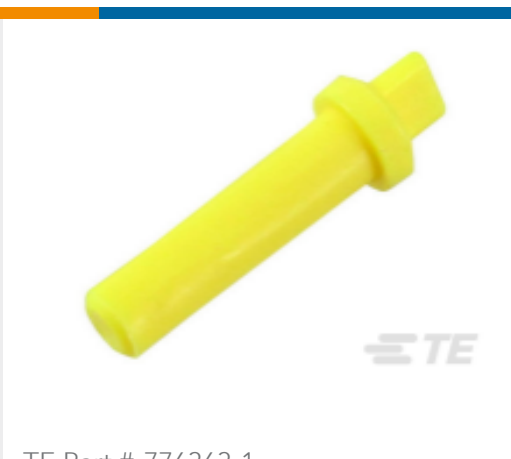
TE Part # 776363-1 SEALING PLUG, SZ 16 CAVITY