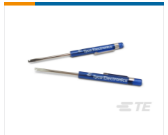
TE Part # CAT-AM7801-T618 Removal Tools — AMPSEAL 16