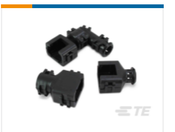
TE Part # CAT-AM7801-B128 AMPSEAL 16 Connectors Backshell