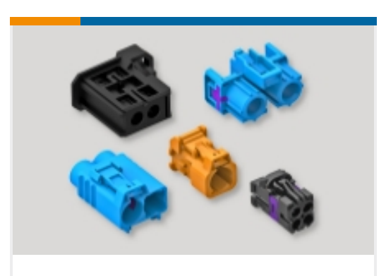
Data Connectivity Housings(3)