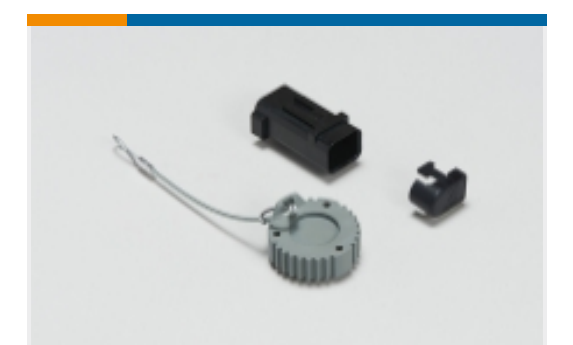
Automotive Connector Caps & Covers (1)