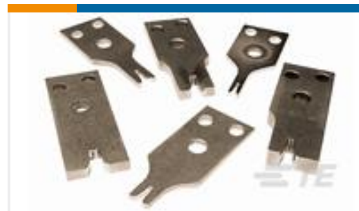
TE Part #1-1633961-2 CRIMPER, INSULATION F PREMIUM