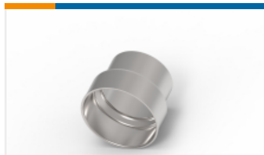
TE Part #2177090-3 STEEL, OUTER FERRULE, 8MM HV, 25SQMM