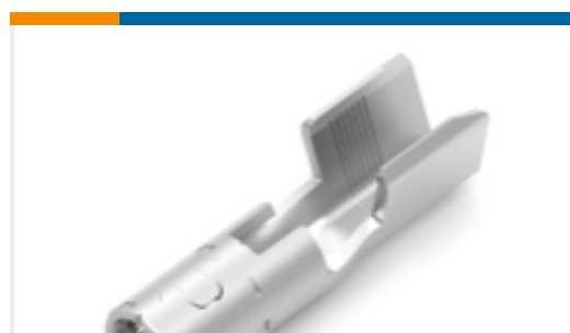
TE Part #2208669-3 8MM HV, CONTACT, ASSY