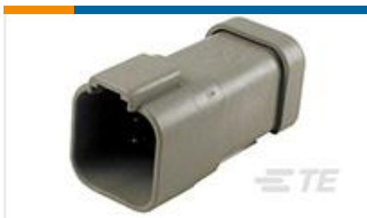
TE Part #DT04-6P-P021 REC, 6P, GRY, BUSBAR 1X6, NICKEL