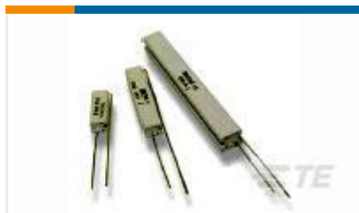
TE Part #1623732-5 BCHE 7 W 12K 5%