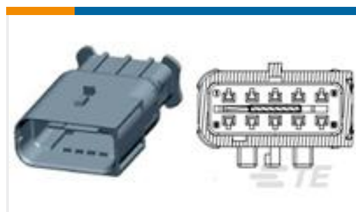
TE Part #1801606-1 TAB HOUSING, MCON, 10 W, SEALED