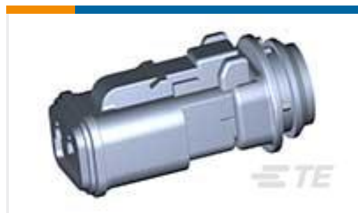
TE Part #DT06-2S-LC01 PLG, 2P, BLK, E, SL RT, DIN BKSHL ADPT