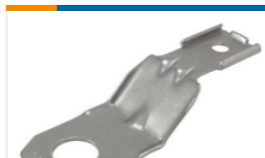
TE Part #1027-001-0800 CLIP, SS, 11MM HOLE, ST, DT8PIN