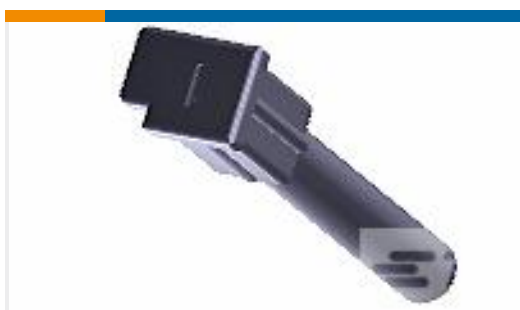
TE Part #1-1452424-1 BLIND PLUG FOR MCON 1.2 CB (0,