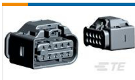
TE Part #1801600-2 RECEPTACLE HOUSING, MCON, 10 W, SEALED