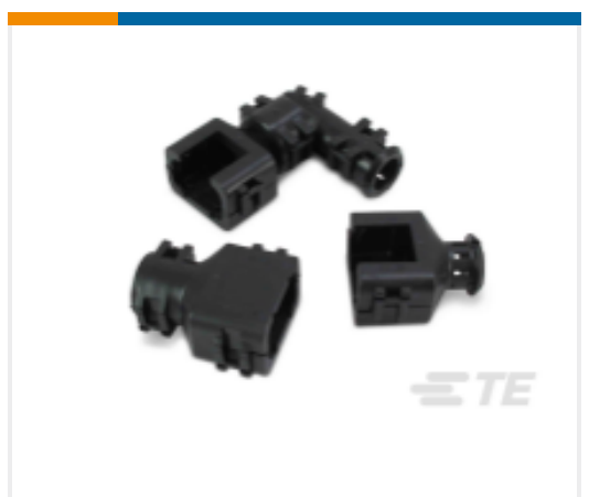
TE Part # CAT-AM7801-B128 AMPSEAL 16 Connectors Backshell