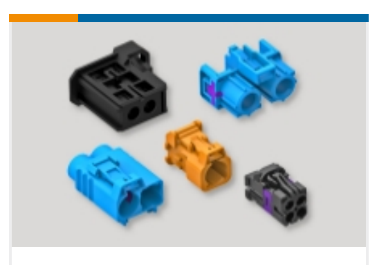
Data Connectivity Housings(3)