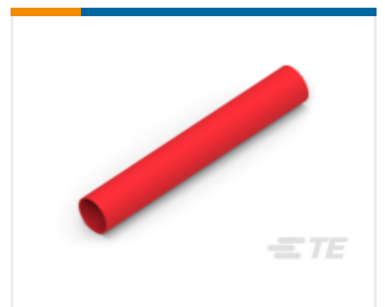
TE Part #NB17032001 DWP-125-1-2-STK