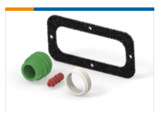
Connector Seals & Cavity Plugs(4)