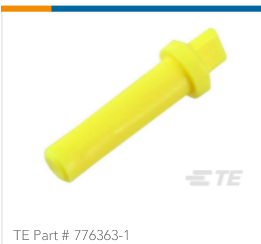
SEALING PLUG, SZ 16 CAVITY