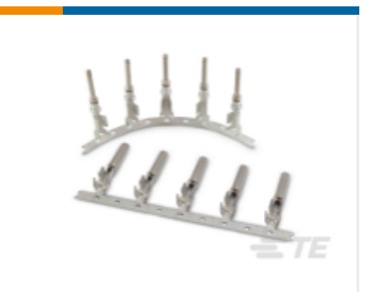
TE Part # CAT-AM7801-T273 Contacts: Size 16, 13A