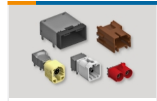
Data Connectivity Headers(2)