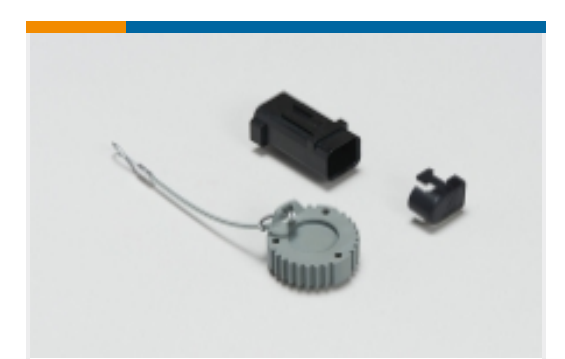
Automotive Connector Caps & Covers