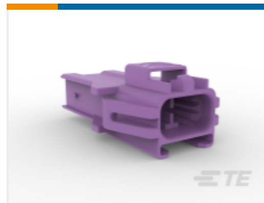
TE Part #6-2378158-2 Power Versa-Lock CAP, 1X2 KEY F