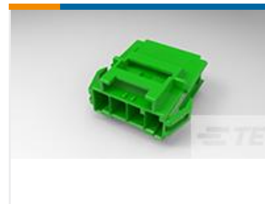
TE Part #7-2232263-4 PTL 1X4 CAP PANEL MT GLW WIRE KEY C GRN