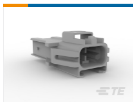
TE Part #2-2378158-2 Power Versa-Lock CAP, 1X2 KEY B