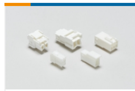
Rectangular Power Connectors(300)