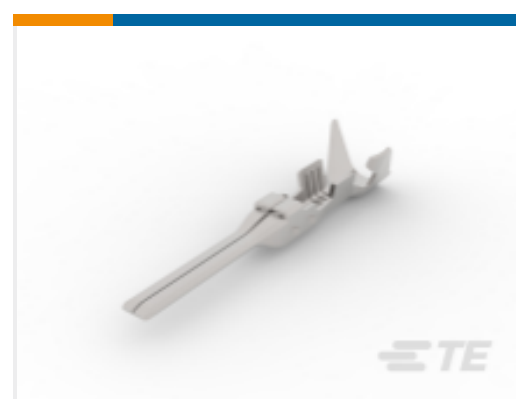
TE Part #2329908-1 Power Versa-Lock SEAL TAB, 18-20 AWG