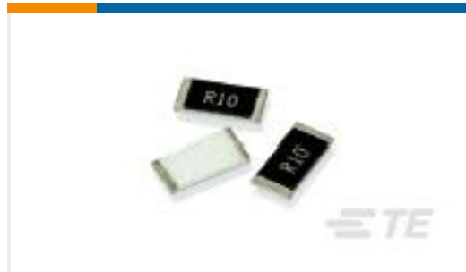
TE Part #4-1879463-7 RL73H 2E R82 1% 1K RL