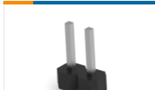
TE Part #2842102-2 2P,2MM,BRK HDR,SRVT,SMD,0.1AU, TR W/CAP