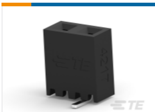
TE Part #2307813-2 2P,2MM,B-B,REC,SR,DE,SMD,0.1AU