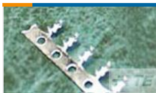
TE Part #1734193-1 WTB Socket,Terminal 80u" Tin