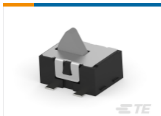
TE Part #2331417-1 DET SW4.7X3.5X2.2 GW VERT. NO AG RL