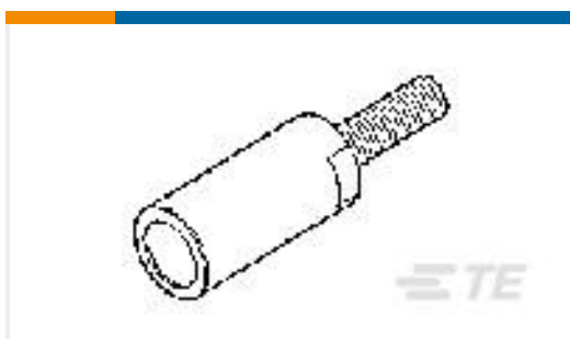
TE Part #192129-1 4MM 10B1S1/4-X 10-32