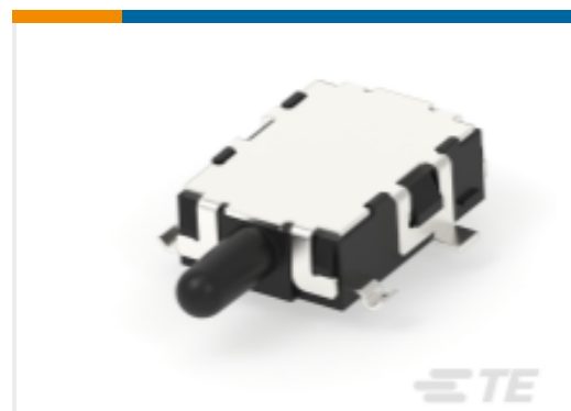
TE Part #2331390-1 DET SW5.7X4.0X2.0 GW HORZ. NC AG RL