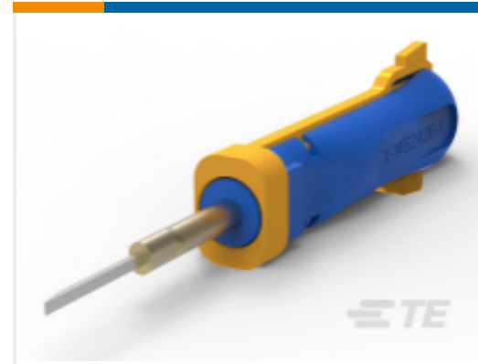
TE Part # 1452426-1 EXTRACTION TOOL