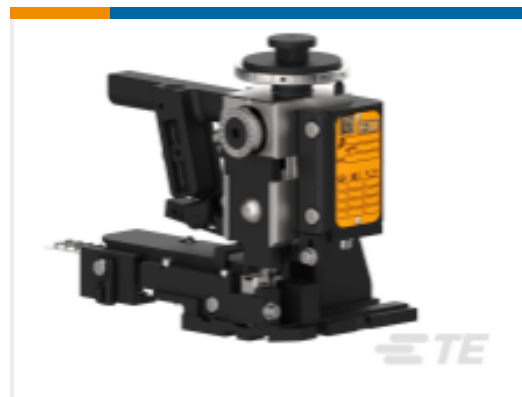
TE Part # 2151741-1 OCEAN_2.0_Applicator-S-120F190F