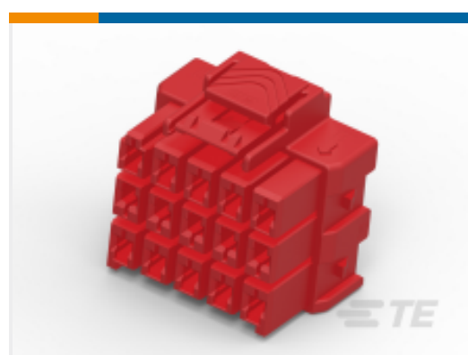
TE Part #5-1971773-3 High Temperature Plug — POWER TRIPLE LOCK