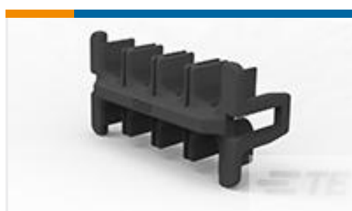
TE Part #1971778-4 PTL TPA HIGH TEMP 2 x 4 BLACK