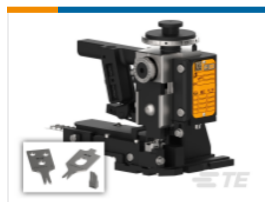
TE Part # 7-2151741-1 OCEAN_2.0_Applicator-S-120F190F