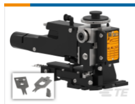
TE Part # 7-2151741-2 OCEAN_2.0_Applicator-S-120F190F