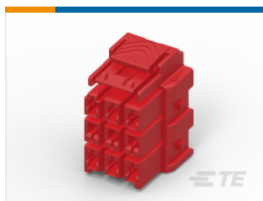
TE Part # 6-1971876-3 PTL 3X3 PLUG HSG HIGH TEMP KEY B RED