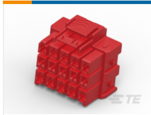
TE Part # CAT-P87074-P729A High Temperature Plug — POWER TRIPLE LOCK