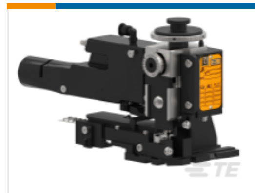
TE Part # 2151741-2 OCEAN_2.0_Applicator-S-120F190F