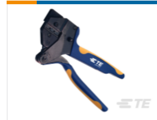
TE Part # 2217268-1 SDE HAND TOOL