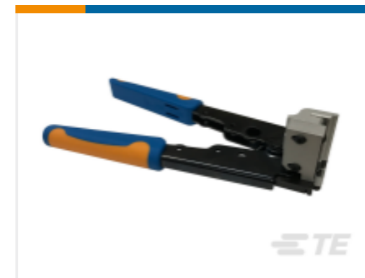
TE Part # 2305570-1 Strip Terminal Cutter-Side Feed-No Crimp