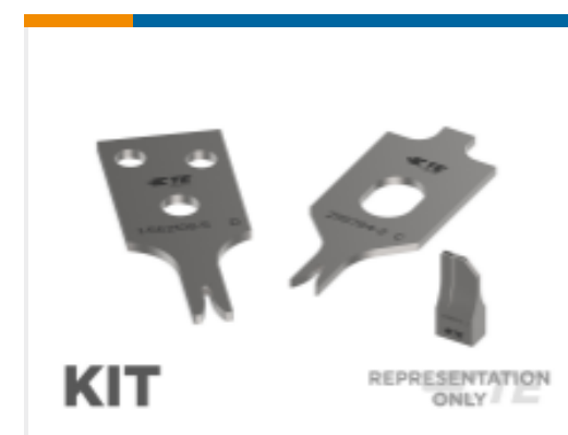
TE Part # 7-2151741-7 OCEAN_2.0_SPARE_PART_KIT-120F190F