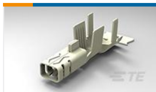
TE Part #1971783-2 PTL RECEPTACLE CONTACT, 16-19 AWG, 2X22