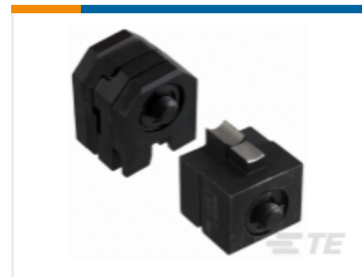
TE Part # 2217268-2 SDE DIE SEET