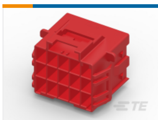
TE Part #5-1971775-3 POWER TRIPLE LOCK High Temperature Caps