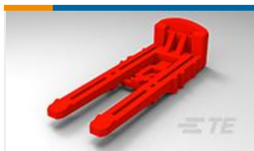
TE Part #1971789-1 CPA