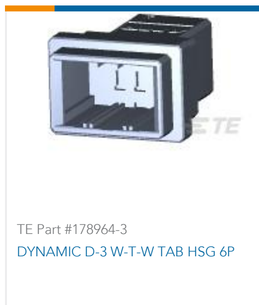
TE Part #178964-3 DYNAMIC D-3 W-T-W TAB HSG 6P