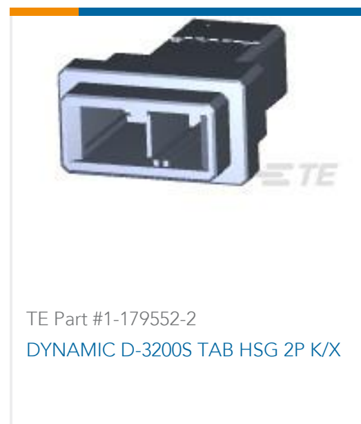
TE Part #1-179552-2 DYNAMIC D-3200S TAB HSG 2P K/X