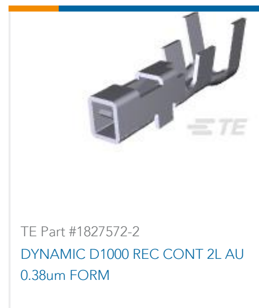
TE Part #1827572-2 DYNAMIC D1000 REC CONT 2L AU 0.38um FORM