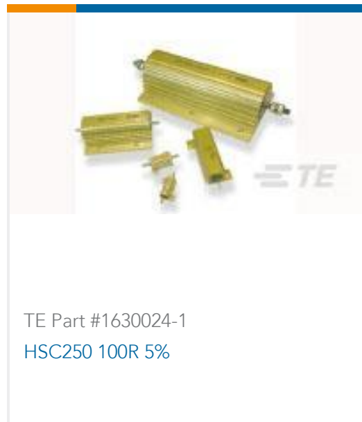
TE Part #1630024-1 HSC250 100R 5%