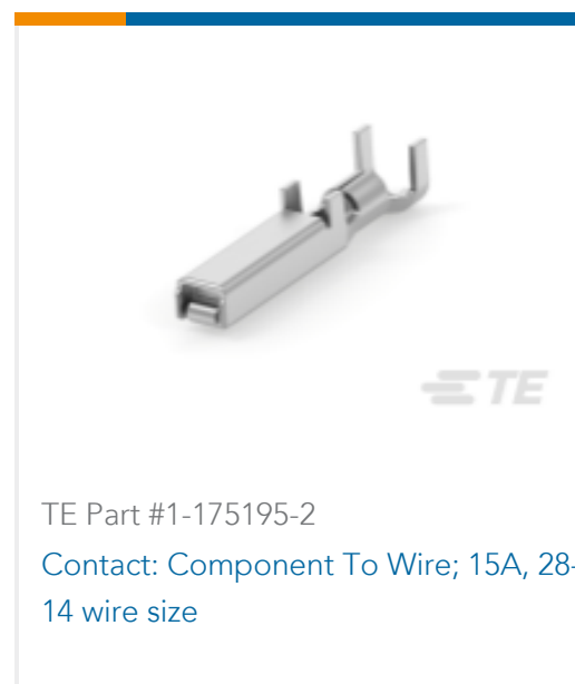
TE Part #1-175195-2 Contact: Component To Wire; 15A, 28-14 wire size