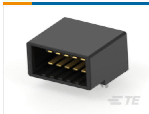
TE Part #178325-2 Header Assembly: Wire-to-Board, 15A, gold or tin plated