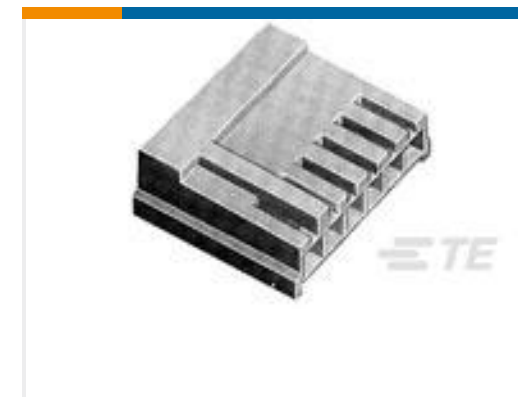
TE Part #1-171822-0 EIS REC. HSG 10P-NATURAL