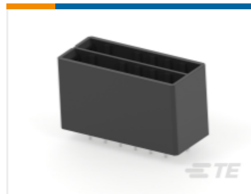
TE Part #2-178136-2 Header Assembly: Wire-to-Board, 15A, gold or tin plated