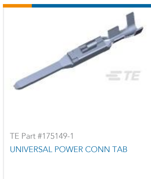
TE Part #175149-1 UNIVERSAL POWER CONN TAB