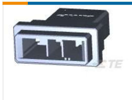
TE Part #1-179552-3 DYNAMIC D-3200 WTW TAB HSG 3P