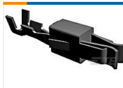
TE Part #927774-3 JPT REC 2.8 Contact SRC Sn