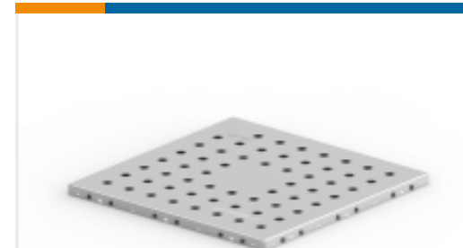
TE Part #2118725-2 STD SHIELD COVER, CRS-44.97X44.97X2.00MM