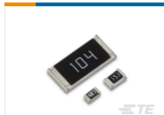
TE Part #2-2176337-4 CRGCQ 0402 820R 1%