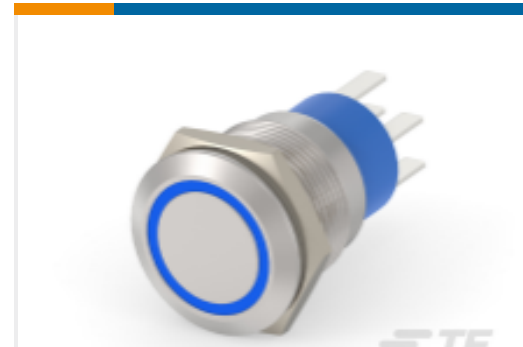
TE Part #7-2213767-7 AV19 DPL 5A MOVE RING LED BLUE 12V