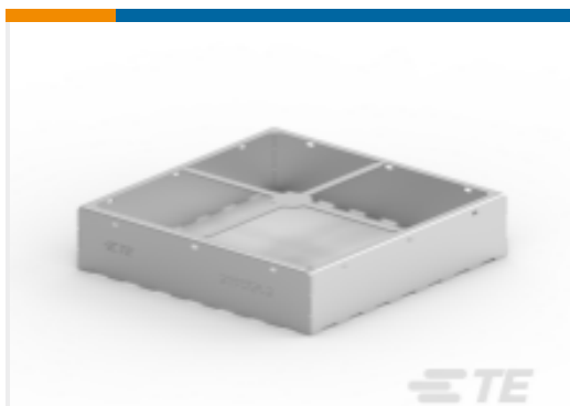
TE Part #2118726-2 STD SHIELD FRAME, CRS-44.37X44.37X9.75MM