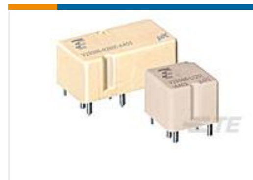
TE Part #1413009-9 V23086C2001A403