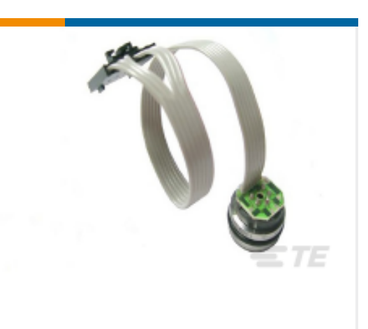
TE Part #86-300A-C 300 PSIA CABLE CONN MV PRESSURE SENSOR