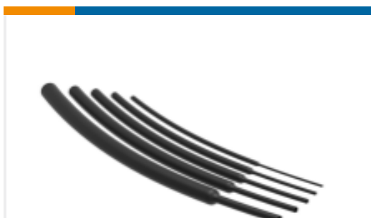
TE Part #NB13264001 RNF-100-3/4-BK-FSP