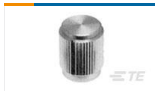
TE Part #5-1437622-8 KN700A1/4=KNOB ALUM KNURL 1/4