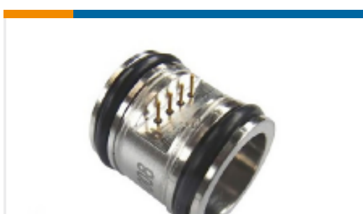
TE Part #DP86-100D 100 PSID MV DIFFERENTIAL PRESSURE SENSOR