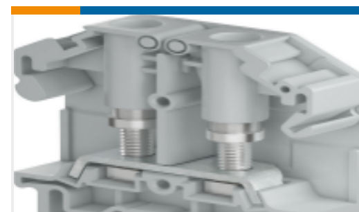
TE Part #1SNA510006R0000 RGW25-M6-V0