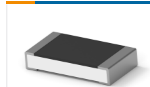
TE Part #6-2176389-3 RQ 1206 475R 0.1% 10PPM 5K RL