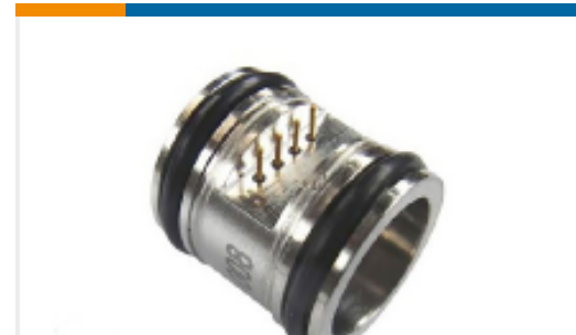
TE Part #DP86-001D 1PSID MV DIFFERENTIAL PRESSURE SENSOR