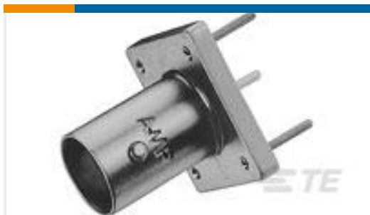
TE Part #1-1337445-0 BNC Str PCB Skt 50Ohm Silver P