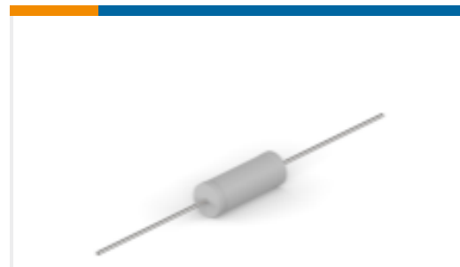
TE Part #6-2176412-9 5W XSM M/OX 5% 3K6