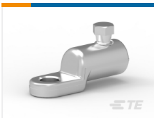
TE Part #A23668-000 BLMT-25/95-13