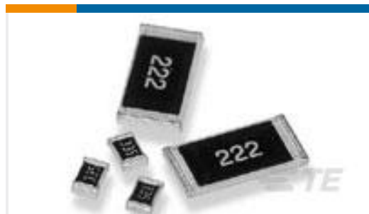
TE Part #1-2176185-3 CRGH0805 1% 4K7 0.33W