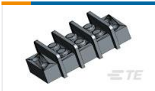
TE Part #1546670-3 3P .437" DR BARRIER,W/BND SCRW