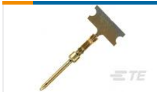
TE Part #1658540-5 CONT,PIN,PLATED,20DF,LP,#24-28