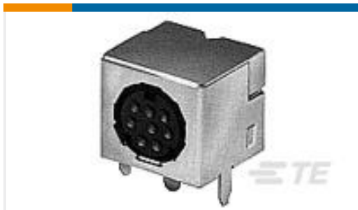
TE Part #5749267-1 Mini DIN, 8 pos, R/A, Shield