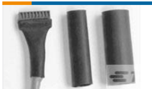
TE Part #6009112002 DWP-125-3/16-0-STK