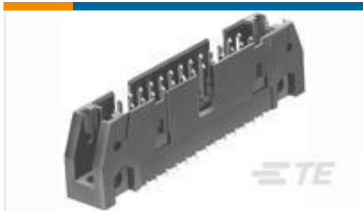
TE Part #102153-4 020 UNIV HDR SP 4S 15DP STD