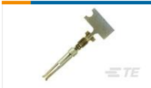
TE Part #1658537-5 CONT,SOCKET,PLATED,20DF,STRIP, #20-24