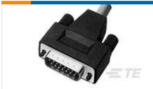
TE Part #1658661-1 KIT,HDP-20,ENCLSUR,PLUG,SIZE 5