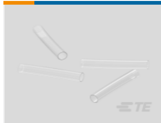
TE Part #NB16092001 RT-375-3/64-X-STK