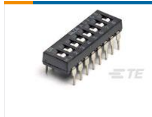
TE Part #4-1825059-1 ADF08ST04=DIP SWT,FLUSH,SMT-GW