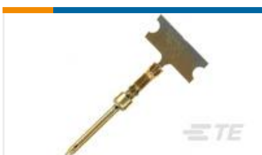
TE Part #1-66507-0 PIN CONTACT, 20 DF