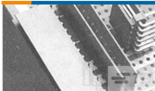
TE Part #281695-6 HEADER HE14 STRAIGHT 6 P