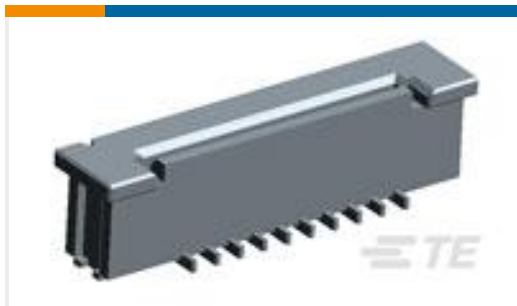
TE Part #2-1734741-8 .5 FPC VT ZIF Type-B 28 CONT