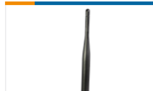
TE Part #ANT-5GMWP1-SMA Antenna Whip 5G/CBRS Swivel SMA