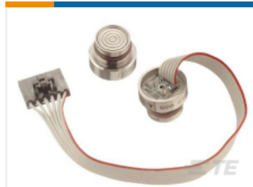
TE Part #85-100A-FC 100 PSIA FLUSH MOUNT PRESSURE SENSOR