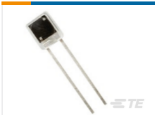
TE Part #20-0696 DETECTOR ASSY 8.07 SQMM