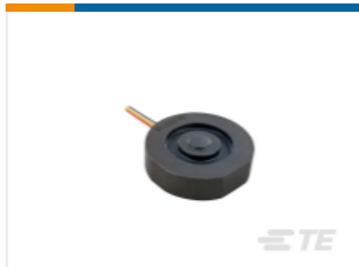
TE Part #20007208-00 FX29XX-S019-0025-L