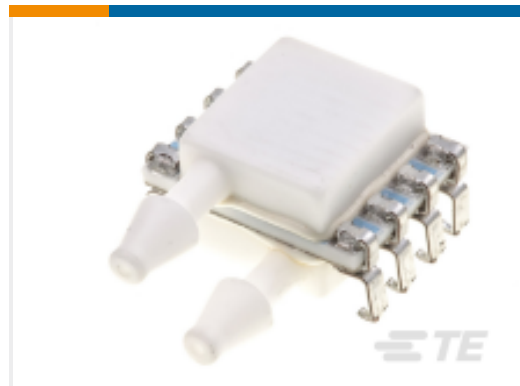
TE Part #4525-DS5A002GP PRESS XDCR, ANALOG, PSI RANGE