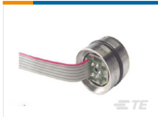
TE Part #154N-030G-R 30 PSIG RIBBON CABLE MV PRESSURE SENSOR