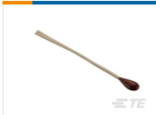
TE Part #11028086-00 DISC-DISCRETE