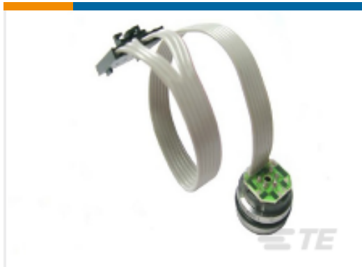
TE Part #86-005G-RT 5 PSIG RIBBON CABLE MV PRESSURE SENSOR