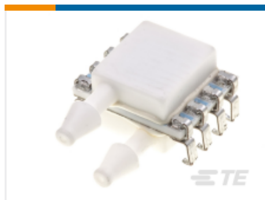
TE Part #4525DO-DS3BS001DS PRESS XDCR,DIGITAL,PSI RANGE