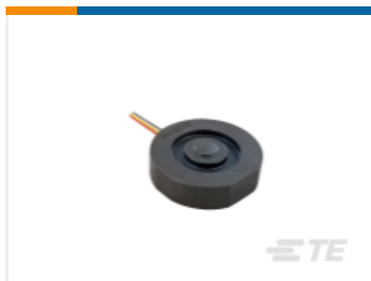
TE Part #20007208-00 FX29XX-S019-0025-L