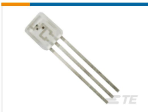
TE Part #20-0584 EMITTER 660/905NM 1 2