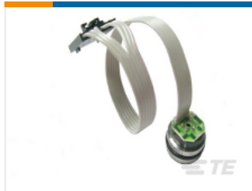
TE Part #86-100G-RT 100 PSIG MV VENT TUBE PRESSURE SENSOR