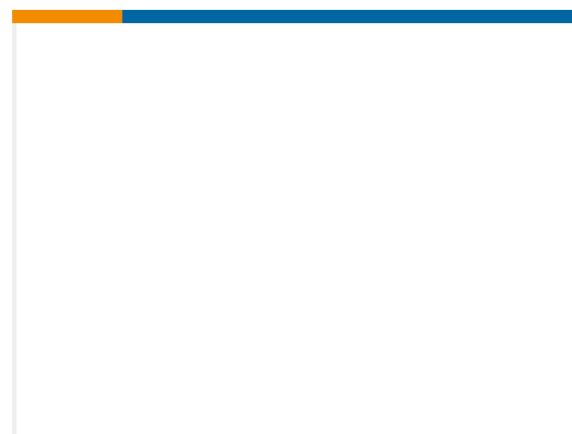
TE Part #374Z-04427 Speed sen DSF 1410.02 AHV L=140