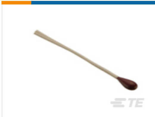
TE Part #11028086-00 DISC-DISCRETE