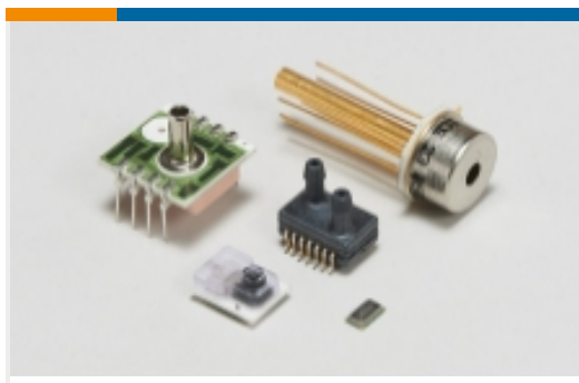
Board Mount Pressure Sensors(35)