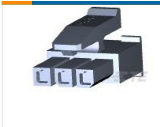
TE Part #1445022-3 MICRO MNL RFECEPT HSG SINGLE R