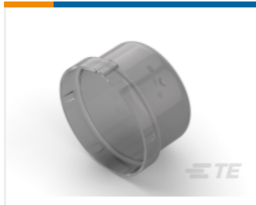
TE Part #2359615-2 LUMAWISE ENDURANCE N+ Lt Gray Short Dome