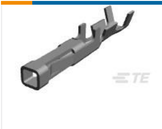
TE Part #1-794607-1 MICRO MNL RPT CNT STRP 15AU LF