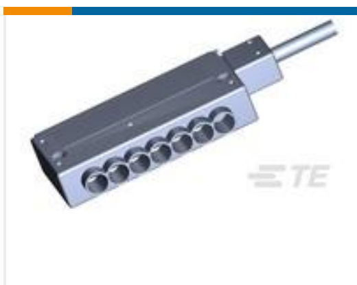
TE Part #1-2083079-1 C/A Nector S Distr to Pigtail LV-2 White