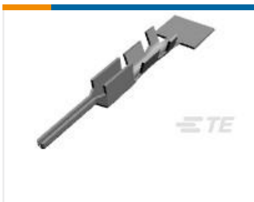
TE Part #1-794608-2 PIN CONT 20-24 30 GOLD STRIP