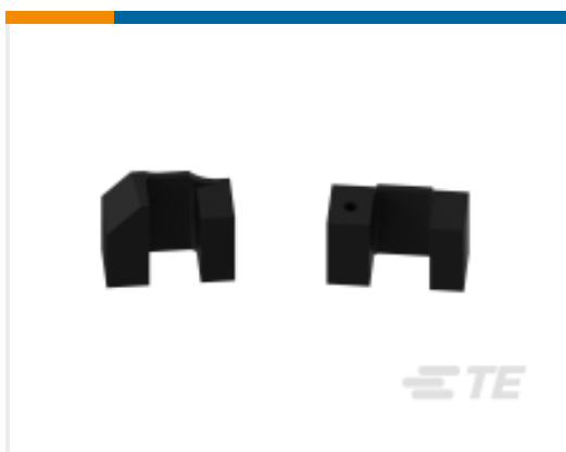
TE Part #2119342-1 HOLDER, FEED FINGER