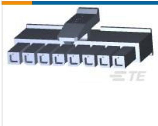
TE Part #1445022-8 MICRO MNL RFECEPT HSG SINGLE R