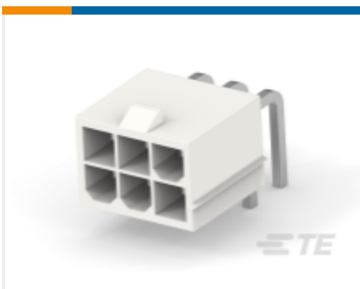
TE Part #5-1586041-6 6P VAL-U-LOK R/A HDR V2 WITH 5PIN TML