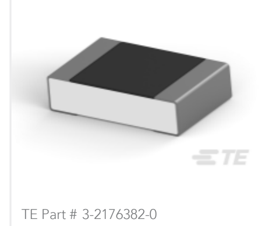
RQ 0805 267K 0.1% 10PPM 5K RL