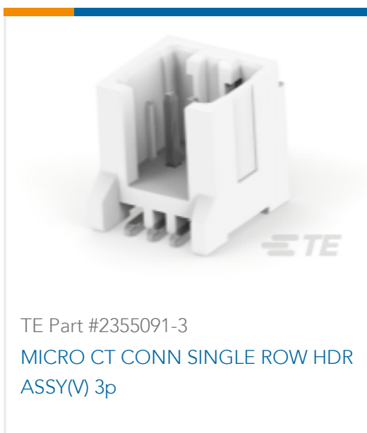
TE Part #2355091-3 MICRO CT CONN SINGLE ROW HDR ASSY(M) 3p