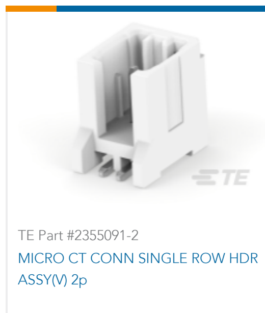
TE Part #2355091-2 MICRO CT CONN SINGLE ROW HDR ASSY(M) 2p