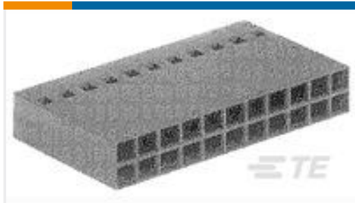
TE Part #104482-9 20 SHORT PT RCPT HSG DR .100CL