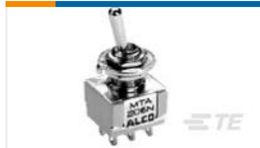
TE Part #1-1437559-8 MTG206N=SWITCH TOG MUSTANG