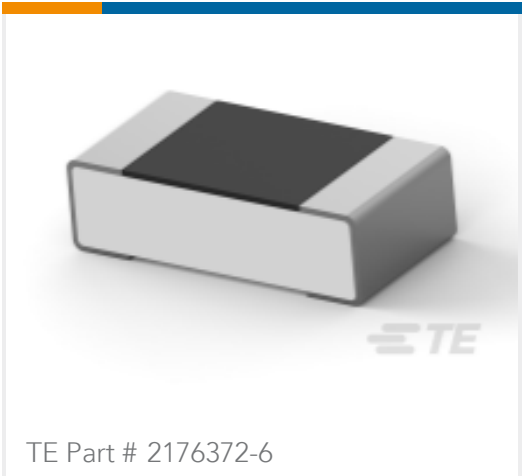
RQ 0603 56K2 0.1% 10PPM 5K RL