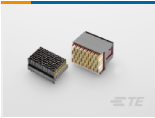
TE Part #2302795-1 RAPLUGASSY,CENTERDP,RTM,VPX, MG RT3