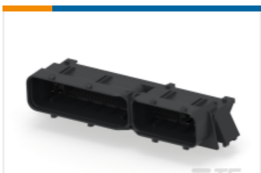
TE Part #2374035-1 121POS, HYBRID, HDR ASSY, 90DEG, SLDR, COD 1