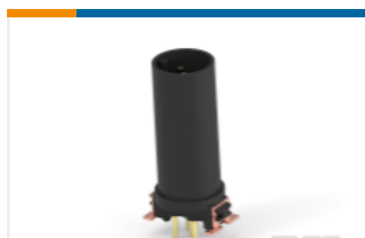
TE Part #484118-E M12 MALE, A CODE, 5P, 17MM THR