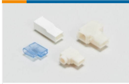
Crimp Terminal Housings(13)