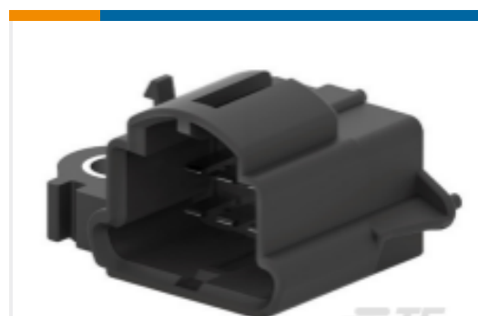
TE Part #963357-6 Low & Medium Power Header