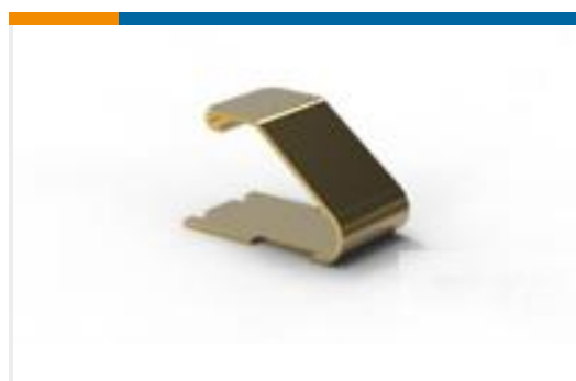
TE Part #1447360-9 3100069=SEALED FINGR 1715EMBOS