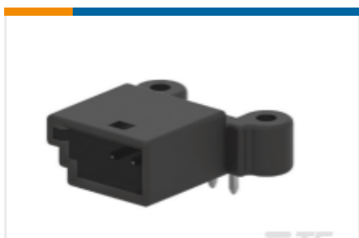
TE Part #174973-2 Signal Header