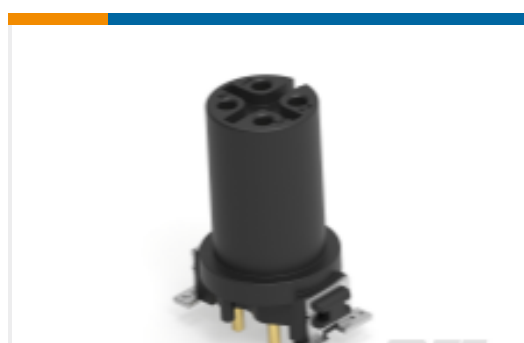
TE Part #494145-E M12 FEMALE, A CODE, 5P, 17MM THR