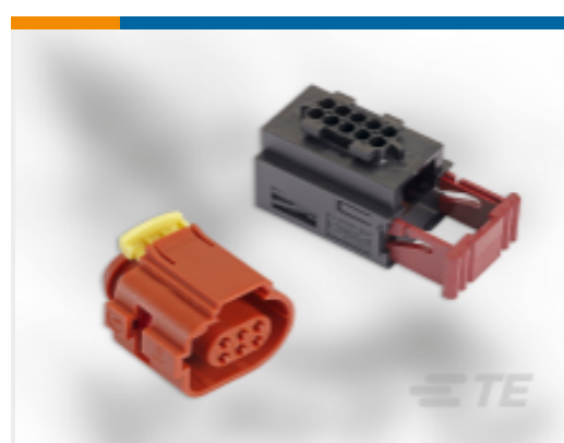
TE Part # CAT-T4827-CH8172 Timer Connector Housing

Also in the Series | Timer Connector System