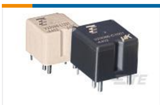
TE Part #1393280-5 V23086C1001A402