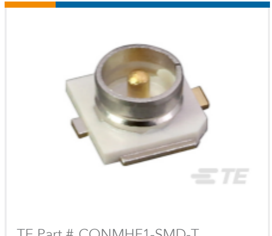
TE Part # CONMHF1-SMD-T U.FL/MHF1 Jack 50 Ohm PCB Surface Mount