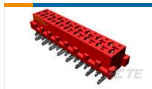
TE Part #7-188275-8 MICRO-MATCH SMD FTE