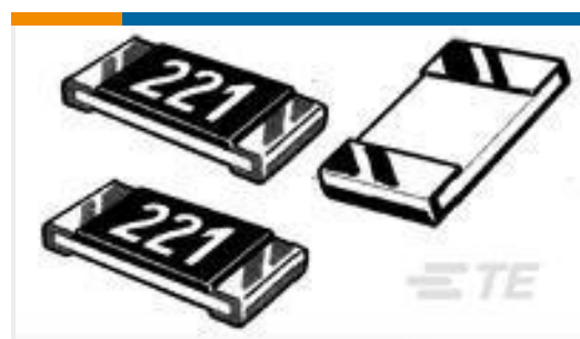
TE Part #4-2176070-9 3521 1K0 1% 2W