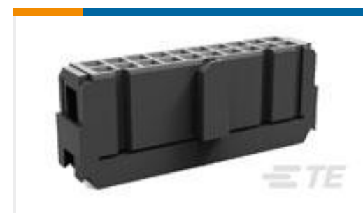
TE Part #1658621-1 10 NOVO MIL/CTR 15DP, LEAD FREE