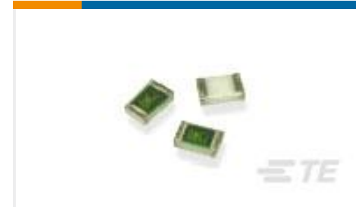
TE Part #1-2176089-0 RP 1J 0.166W 13K3 0.1% 25PPM 1K RL