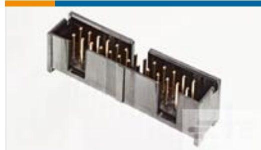
TE Part #5103308-1 A/L LOW PRO HDR 10P VERT BLACK