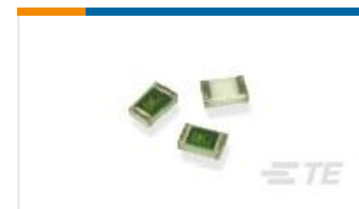
TE Part #1676153-2 RN 0805 10K 0.1% 10PPM 1KRL