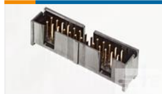
TE Part #5103308-5 A/L LOW PRO HDR 20P VERT BLACK