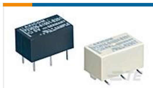
TE Part #1-1393774-2 V23026A1004B201