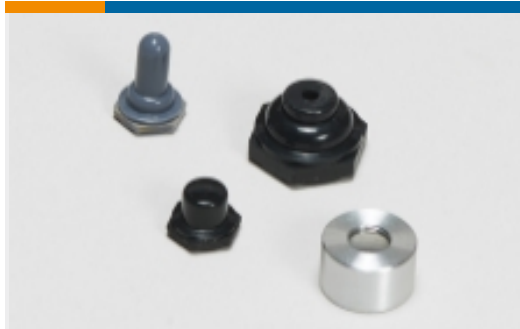
Switch Seals & Accessories(8)