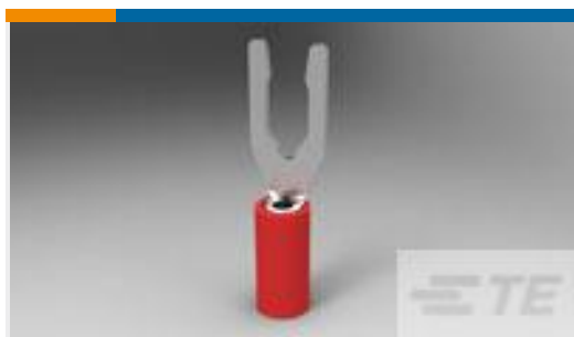
TE Part #1-52410-0 PIDG 22-16 SPG SPD 8,NAT