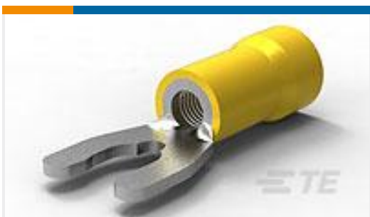
TE Part #52963-5 TERMINAL,PG SPR SPD 12-10 10