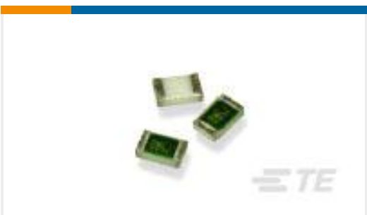
TE Part #1-1879061-0 CPF 0402 20R 0.1% 25PPM 5K RL