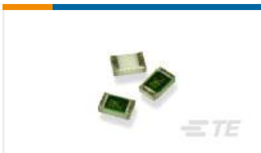
TE Part #1879216-4 CPF 0402 53K6 0.1% 25PPM 1K RL