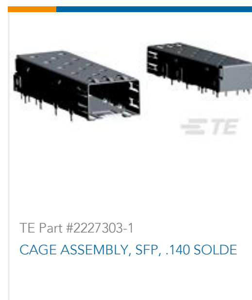
TE Part #2227303-1 CAGE ASSEMBLY, SFP, .140 SOLDE