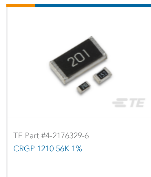
TE Part #4-2176329-6 CRGP 1210 56K 1%