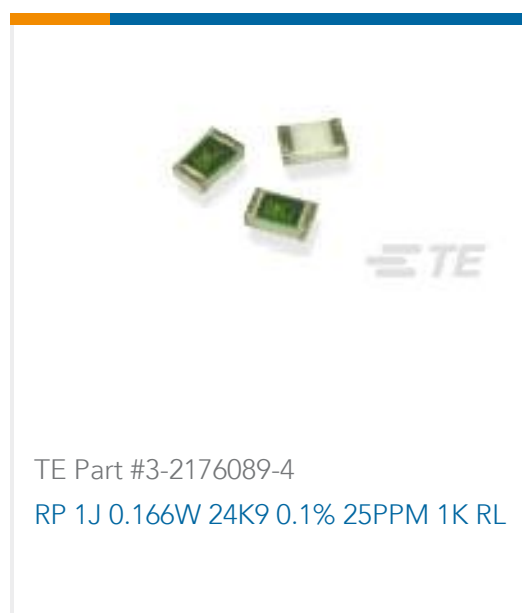
TE Part #3-2176089-4 RP 1J 0.166W 24K9 0.1% 25PPM 1K RL