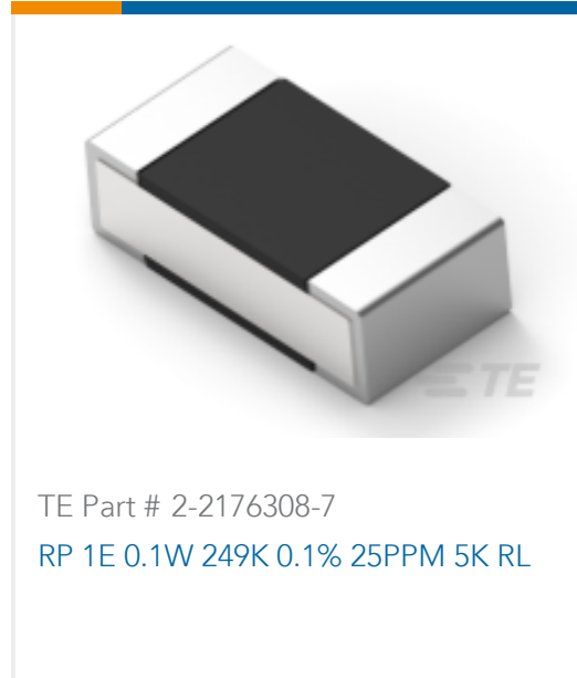
TE Part # 2-2176308-7 RP 1E 0.1W 249K 0.1% 25PPM 5K RL