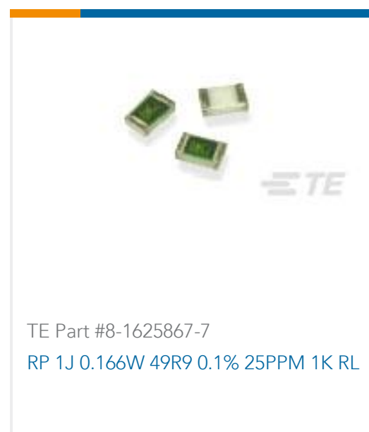
TE Part #8-1625867-7 RP 1J 0.166W 49R9 0.1% 25PPM 1K RL