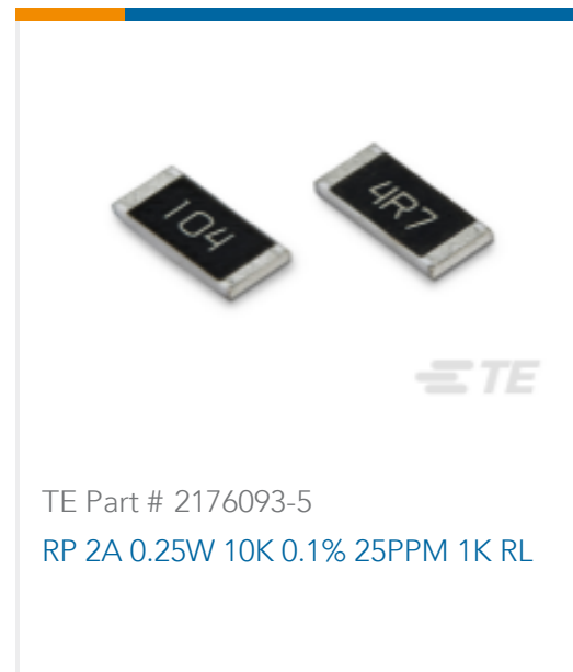
TE Part # 2176093-5 RP 2A 0.25W 10K 0.1% 25PPM 1K RL