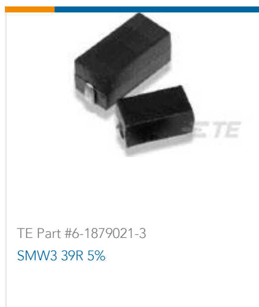
TE Part #6-1879021-3 SMW3 39R 5%