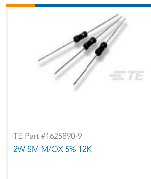
TE Part #1625890-9 2W SM M/OX 5% 12K