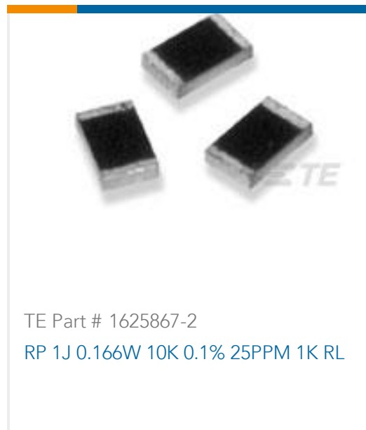
TE Part # 1625867-2 RP 1J 0.166W 10K 0.1% 25PPM 1K RL