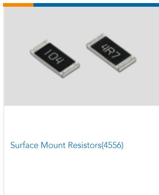
Surface Mount Resistors(4556)