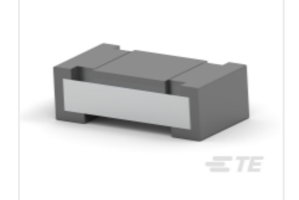
TE Part # CAT-C339-R529A Thick Film Resistor: Current Sense