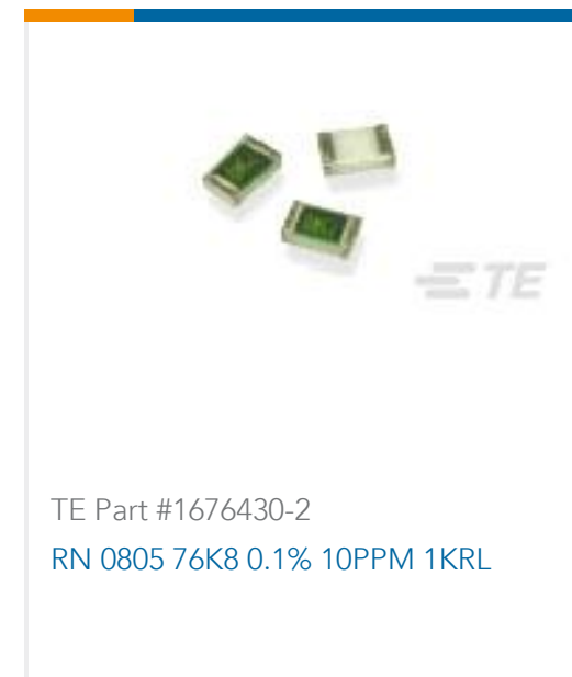
TE Part #1676430-2 RN 0805 76K8 0.1% 10PPM 1KRL