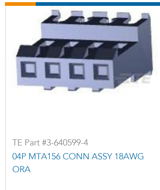
TE Part #3-640599-4 04P MTA156 CONN ASSY 18AWG ORA