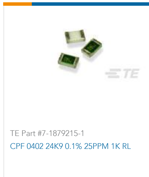
TE Part #7-1879215-1 CPF 0402 24K9 0.1% 25PPM 1K RL