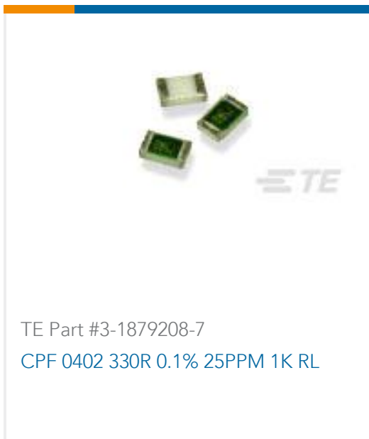
TE Part #3-1879208-7 CPF 0402 330R 0.1% 25PPM 1K RL