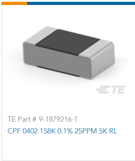
TE Part # 9-1879216-1 CPF 0402 158K 0.1% 25PPM 5K RL