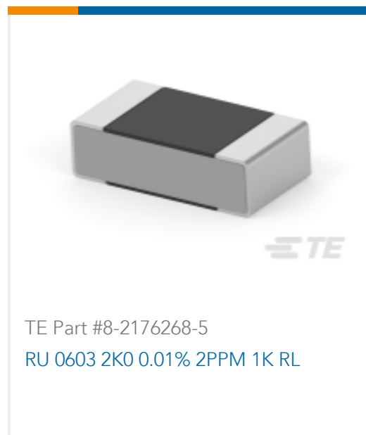
TE Part #8-2176268-5 RU 0603 2K0 0.01% 2PPM 1K RL