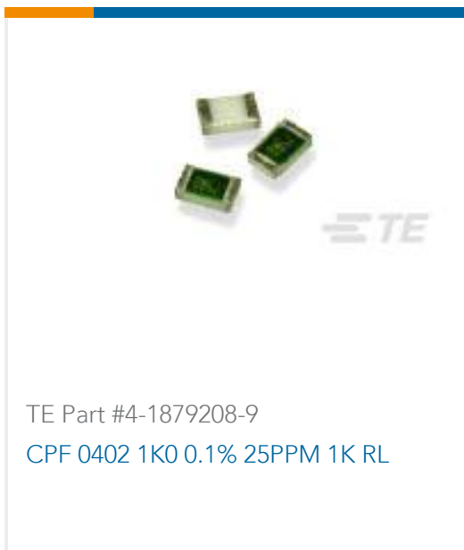
TE Part #4-1879208-9 CPF 0402 1K0 0.1% 25PPM 1K RL