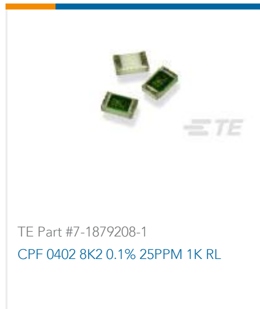
TE Part #7-1879208-1 CPF 0402 8K2 0.1% 25PPM 1K RL