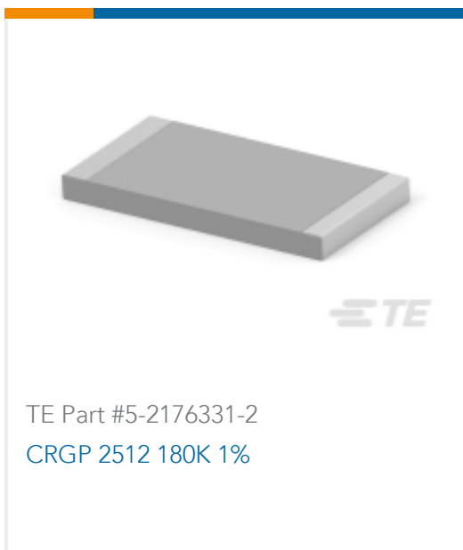
TE Part #5-2176331-2 CRGP 2512 180K 1%