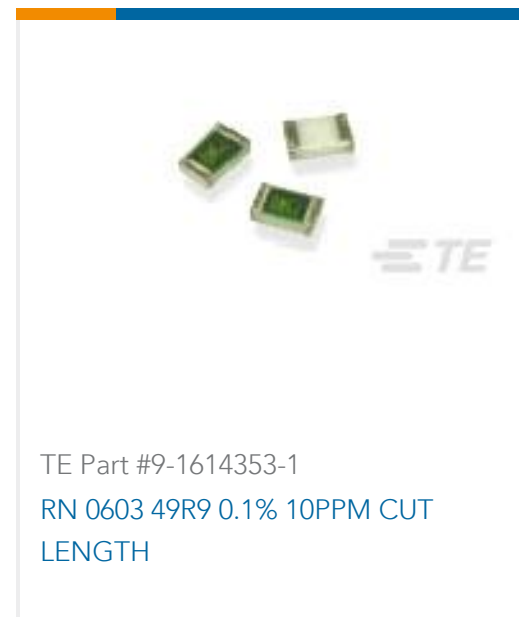
TE Part #9-1614353-1 RN 0603 49R9 0.1% 10PPM CUT LENGTH