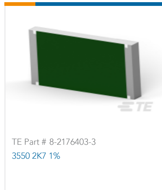
TE Part # 8-2176403-3 3550 2K7 1%