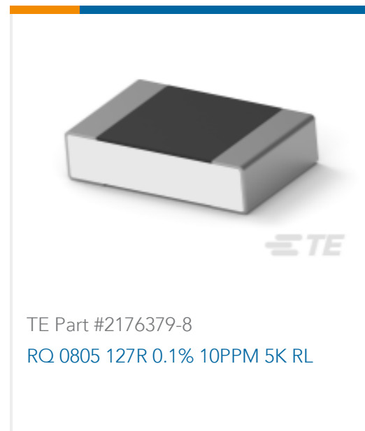
TE Part #2176379-8 RQ 0805 127R 0.1% 10PPM 5K RL