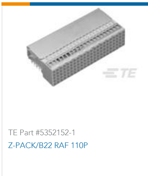
TE Part #5352152-1 Z-PACK/B22 RAF 110P