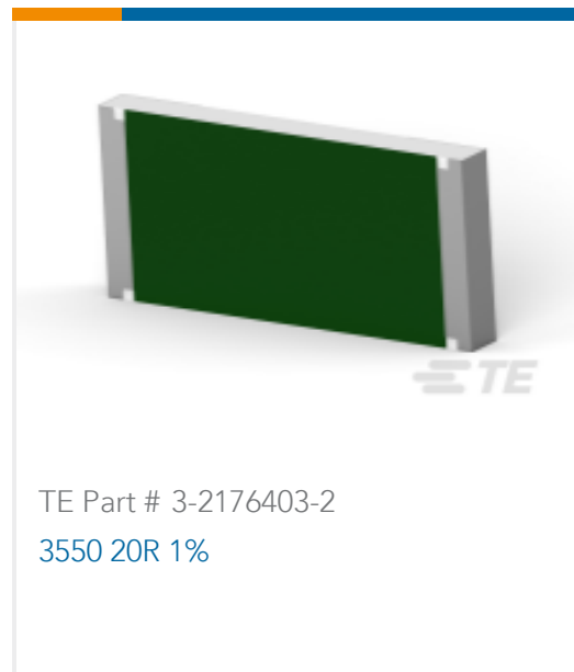
TE Part # 3-2176403-2 3550 20R 1%