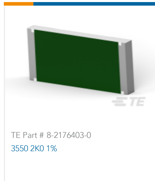
TE Part # 8-2176403-0 3550 2K0 1%