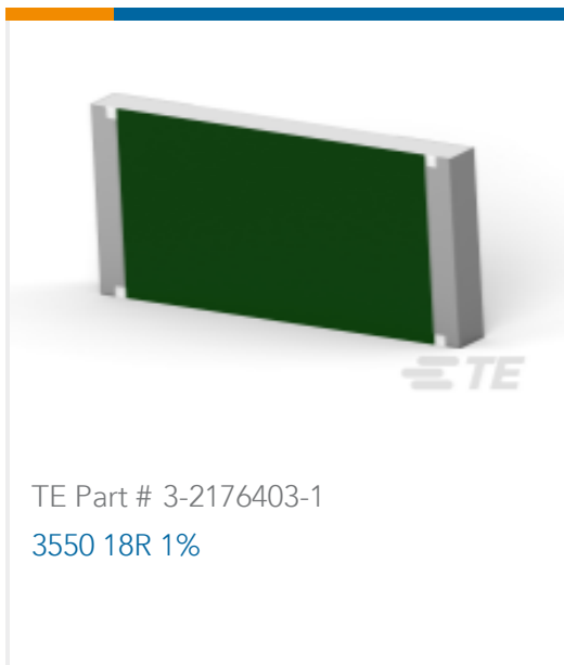
TE Part # 3-2176403-1 3550 18R 1%