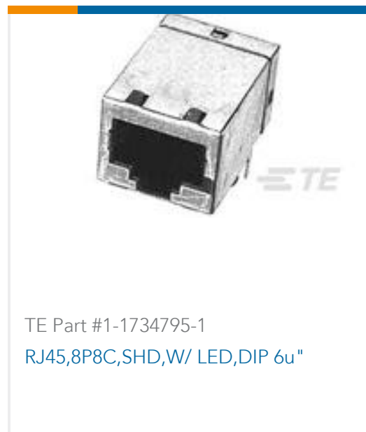
TE Part #1-1734795-1 RJ45,8P8C,SHD,W/ LED,DIP 6u