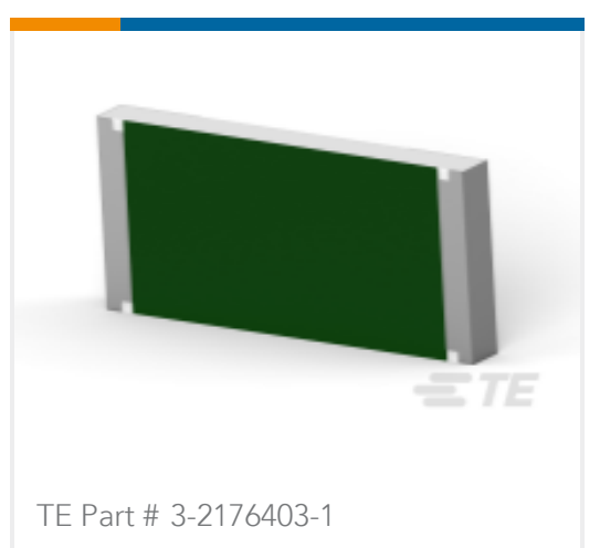
3550 18R 1%