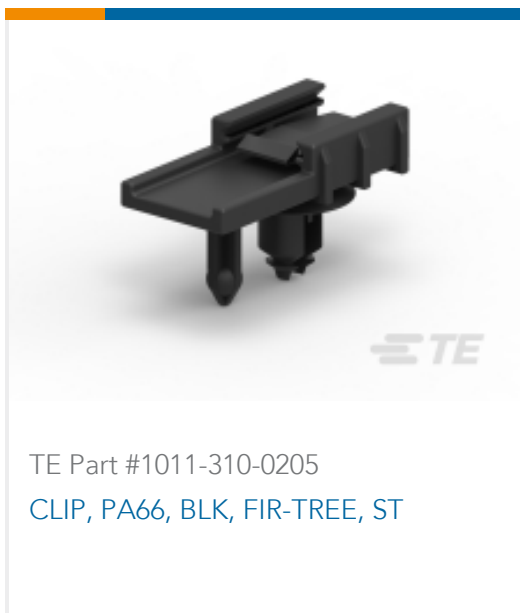
TE Part #1011-310-0205 CLIP, PA66, BLK, FIR-TREE, ST