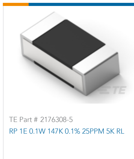
TE Part # 2176308-5 RP 1E 0.1W 147K 0.1% 25PPM 5K RL