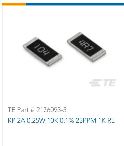
TE Part # 2176093-5 RP 2A 0.25W 10K 0.1% 25PPM 1K RL