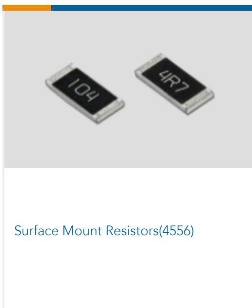
Surface Mount Resistors(4556)