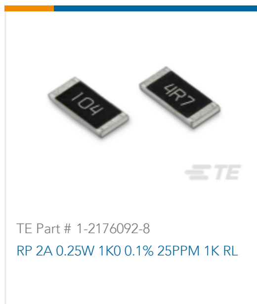
TE Part # 1-2176092-8 RP 2A 0.25W 1K0 0.1% 25PPM 1K RL