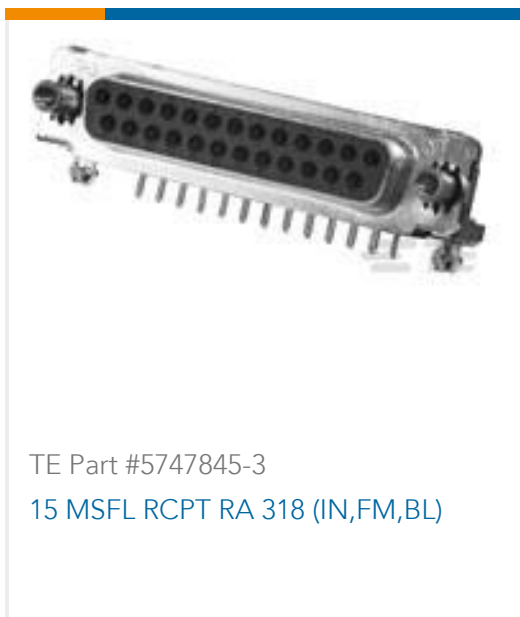
TE Part #5747845-3 15 MSFL RCPT RA 318 (IN,FM,BL)