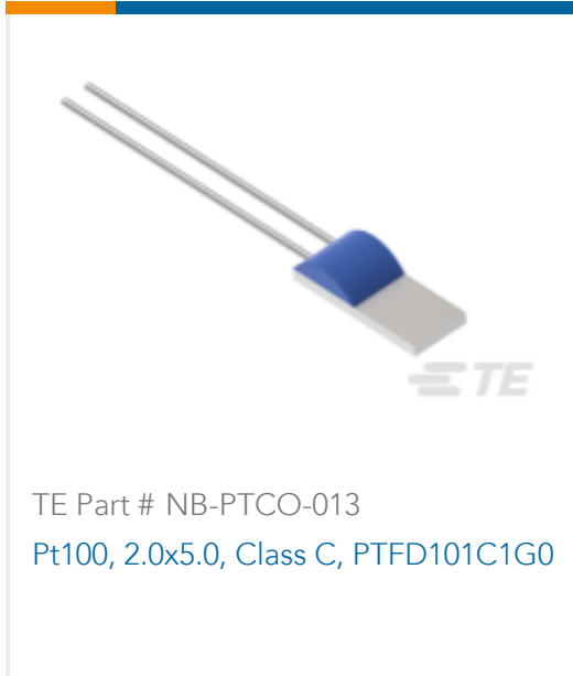
TE Part # NB-PTCO-013 Pt100, 2.0x5.0, Class C, PTFD101C1G0