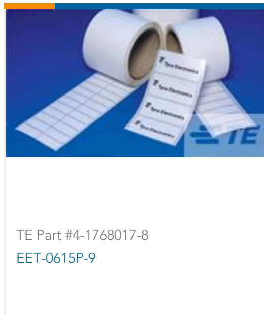
TE Part #4-1768017-8 EET-0615P-9