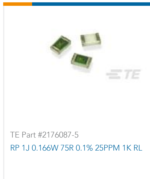
TE Part #2176087-5 RP 1J 0.166W 75R 0.1% 25PPM 1K RL