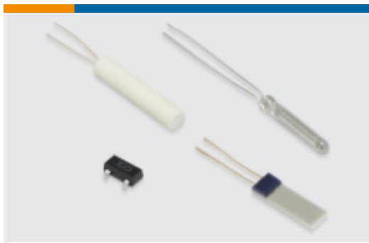
RTD Sensor Elements(53)