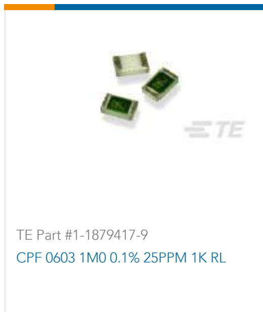
TE Part #1-1879417-9 CPF 0603 1M0 0.1% 25PPM 1K RL