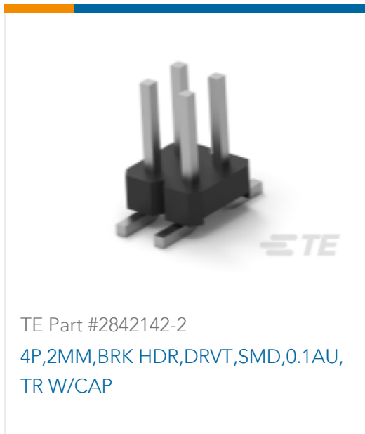
TE Part #2842142-2 4P,2MM,BRK HDR,DRV,T,SMD,0.1AU, TR W/CAP