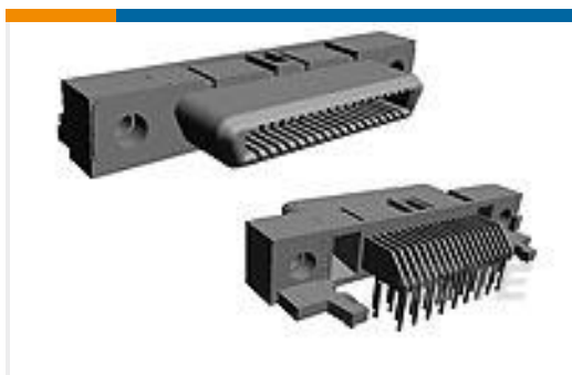
TE Part #5796055-1 68 CHAMP R/A ASSY,LC