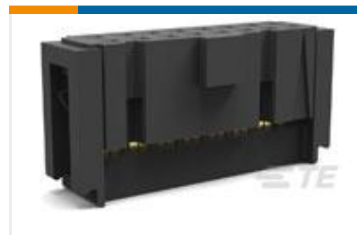
TE Part #2-1658527-8 622-3441LF=FSKT IDC S 34 30AU