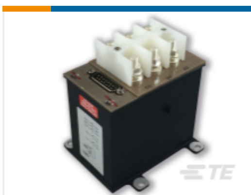
TE Part #1-1616975-7 B309A=CONTACTOR 3PST NO 130 AMP