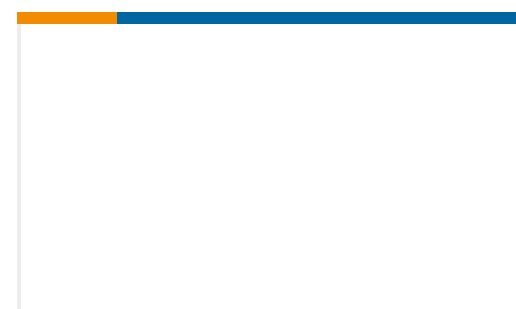
TE Part #YDBC54H-1419PWW001 HERM RECP