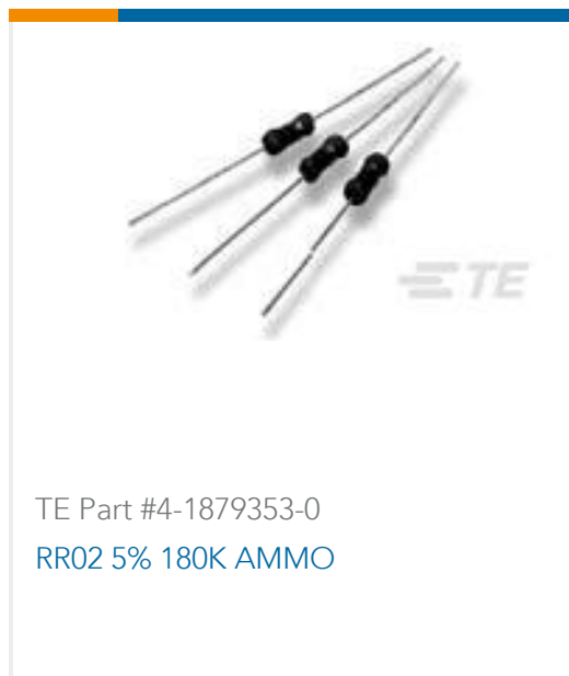
TE Part #4-1879353-0 RR02 5% 180K AMMO