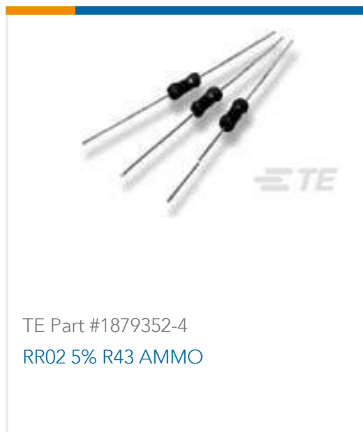
TE Part #1879352-4 RR02 5% R43 AMMO