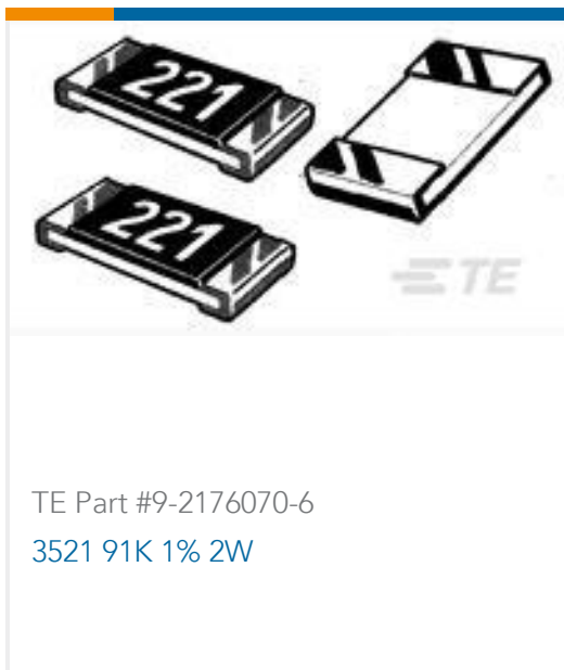
TE Part #9-2176070-6 3521 91K 1% 2W