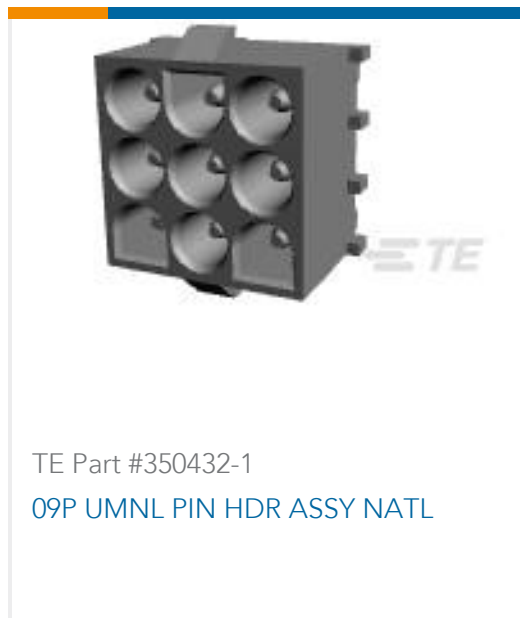
TE Part #350432-1 09P UMNL PIN HDR ASSY NATL