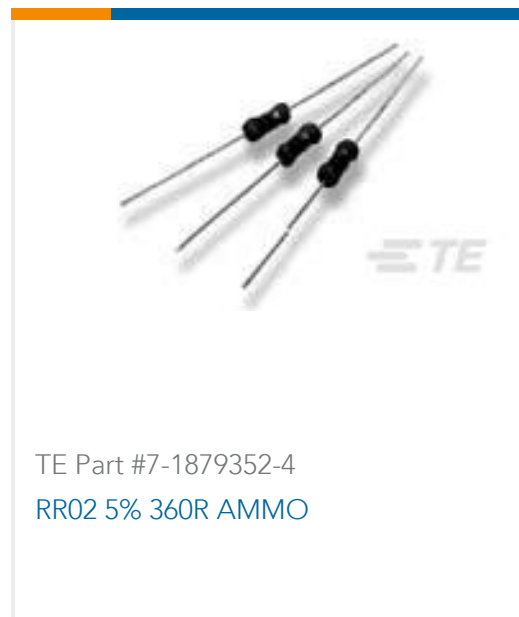
TE Part #7-1879352-4 RR02 5% 360R AMMO