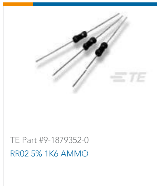
TE Part #9-1879352-0 RR02 5% 1K6 AMMO