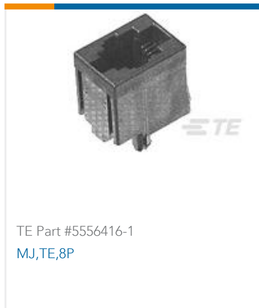
TE Part #5556416-1 MJ,TE,8P