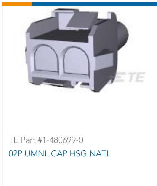
TE Part #1-480699-0 02P UMNL CAP HSG NATL