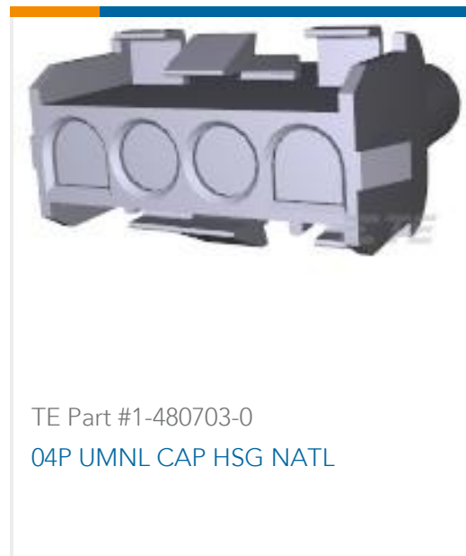
TE Part #1-480703-0 04P UMNL CAP HSG NATL