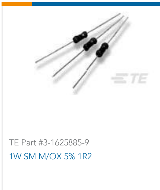
TE Part #3-1625885-9 1W SM M/OX 5% 1R2