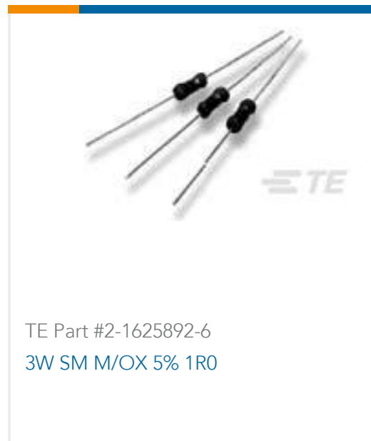
TE Part #2-1625892-6 3W SM M/OX 5% 1R0