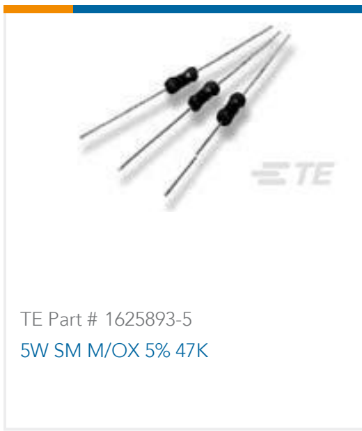
TE Part # 1625893-5 5W SM M/OX 5% 47K