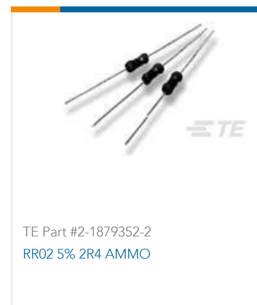
TE Part #2-1879352-2 RR02 5% 2R4 AMMO