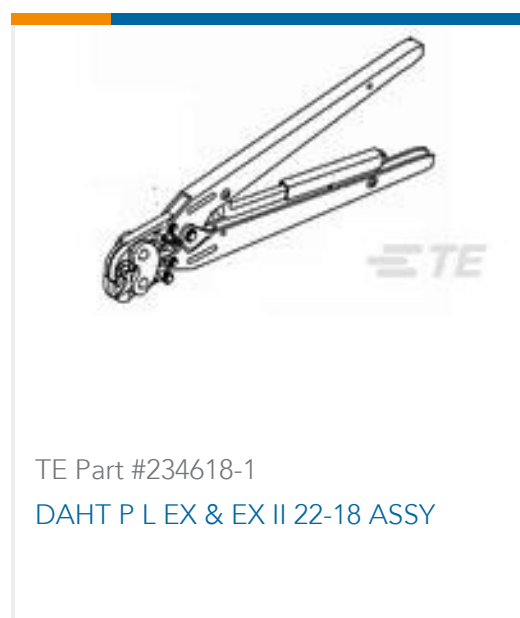
TE Part #234618-1 DAHT P L EX & EX II 22-18 ASSY