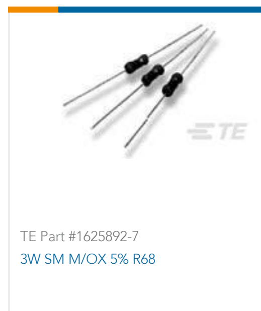
TE Part #1625892-7 3W SM M/OX 5% R68