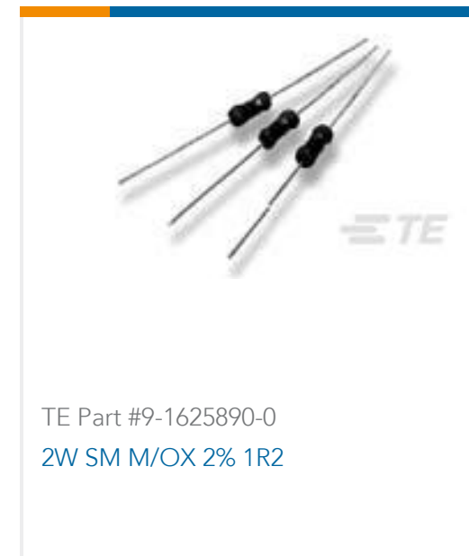
TE Part #9-1625890-0 2W SM M/OX 2% 1R2