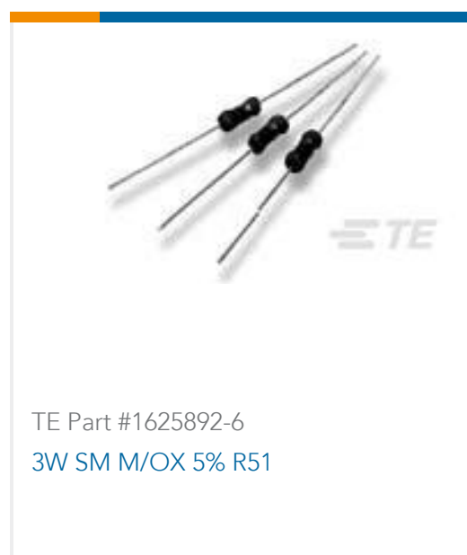
TE Part #1625892-6 3W SM M/OX 5% R51