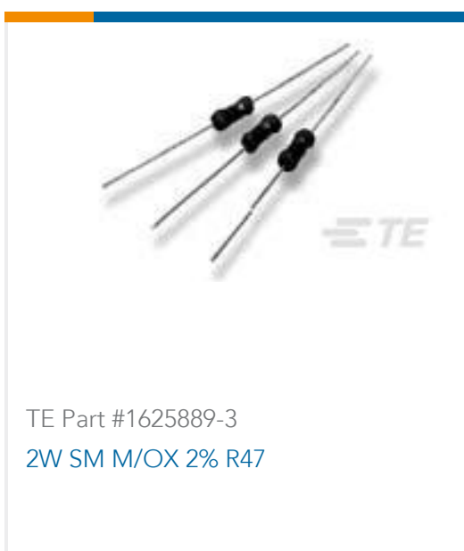
TE Part #1625889-3 2W SM M/OX 2% R47