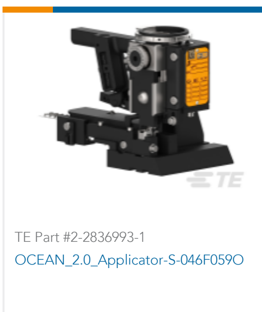
TE Part #2-2836993-1 OCEAN_2.0_Applicator-S-046F0590