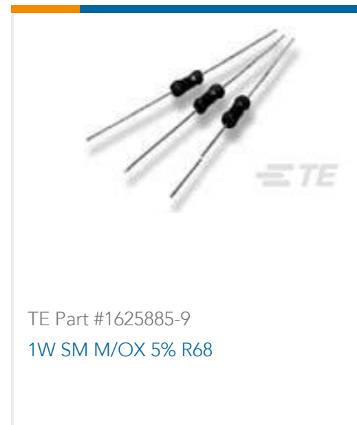
TE Part #1625885-9 1W SM M/OX 5% R68