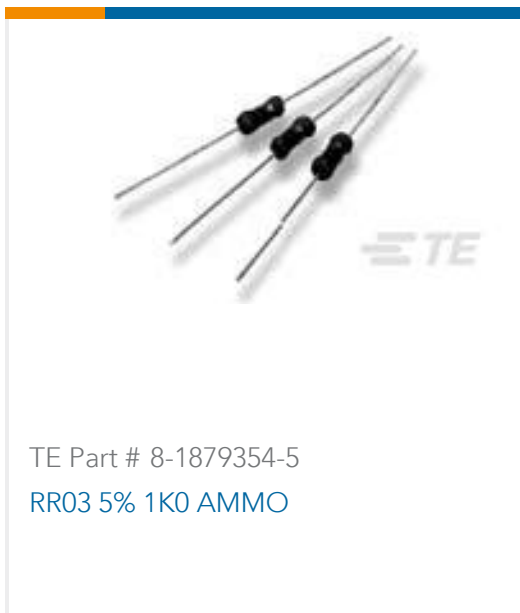
TE Part # 8-1879354-5 RR03 5% 1K0 AMMO