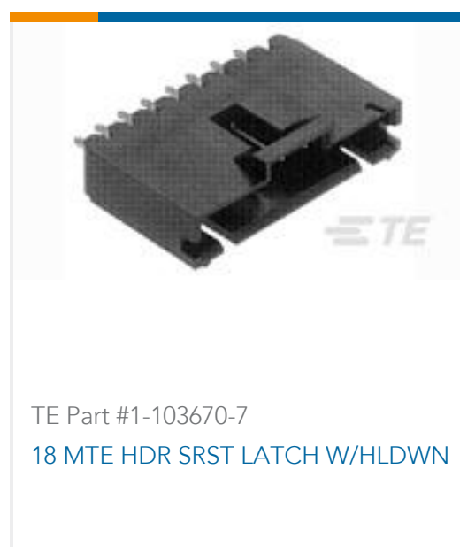
TE Part #1-103670-7 18 MTE HDR SRST LATCH W/HLDWN