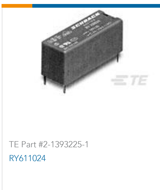
TE Part #2-1393225-1 RY611024