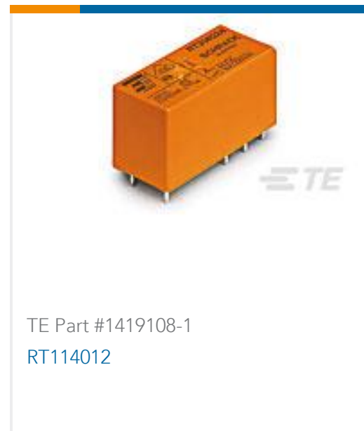
TE Part #1419108-1 RT114012