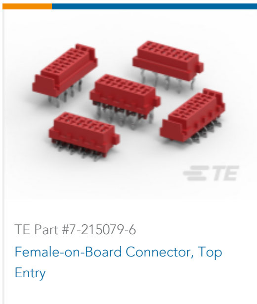
TE Part #7-215079-6 Female-on-Board Connector, Top Entry