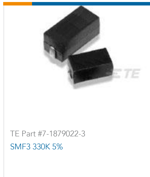
TE Part #7-1879022-3 SMF3 330K 5%