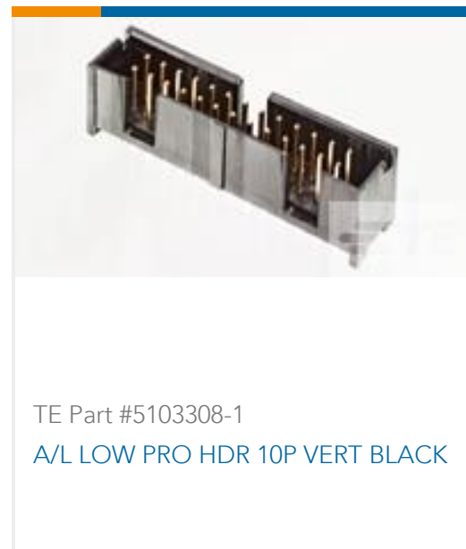
TE Part #5103308-1 A/L LOW PRO HDR 10P VERT BLACK