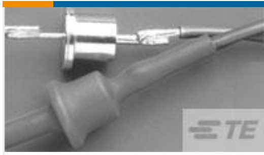
TE Part #5677604005 RNF-3000-24/8-0-SP