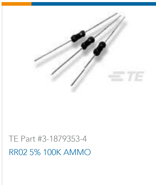
TE Part #3-1879353-4 RR02 5% 100K AMMO