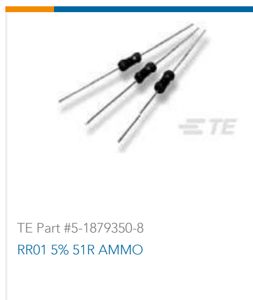
TE Part #5-1879350-8 RR01 5% 51R AMMO