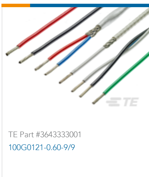
TE Part #3643333001 100G0121-0.60-9/9