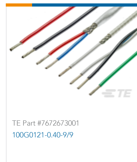
TE Part #7672673001 100G0121-0.40-9/9