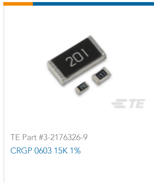
TE Part #3-2176326-9 CRGP 0603 15K 1%