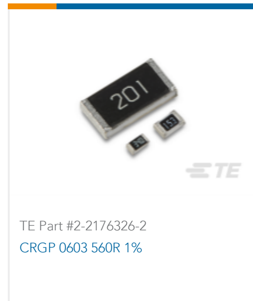
TE Part #2-2176326-2 CRGP 0603 560R 1%