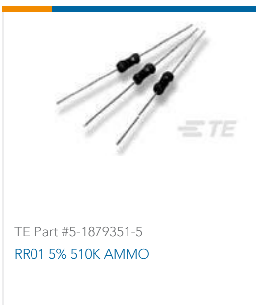
TE Part #5-1879351-5 RR01 5% 510K AMMO