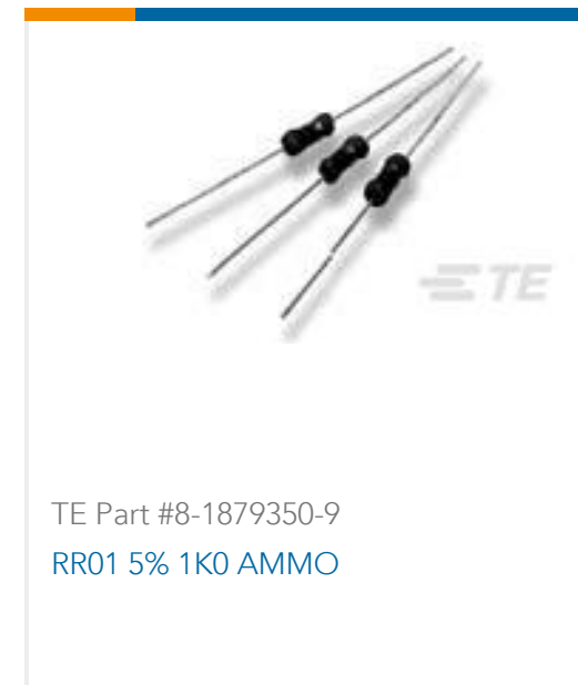
TE Part #8-1879350-9 RR01 5% 1K0 AMMO