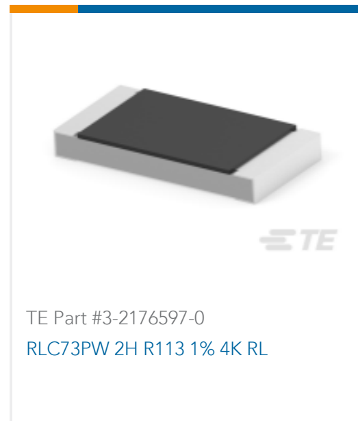
TE Part #3-2176597-0 RLC73PW 2H R113 1% 4K RL