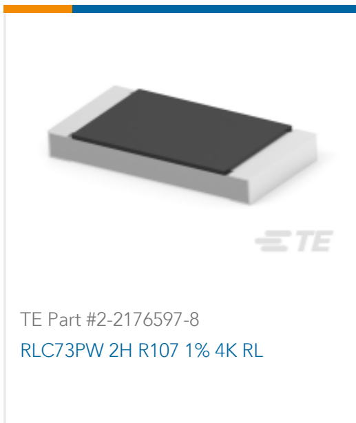
TE Part #2-2176597-8 RLC73PW 2H R107 1% 4K RL