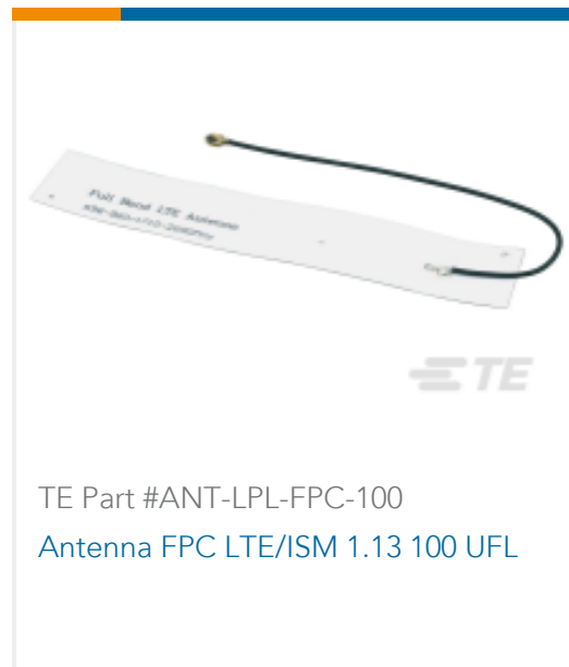
TE Part #ANT-LPL-FPC-100 Antenna FPC LTE/ISM 1.13 100 UFL