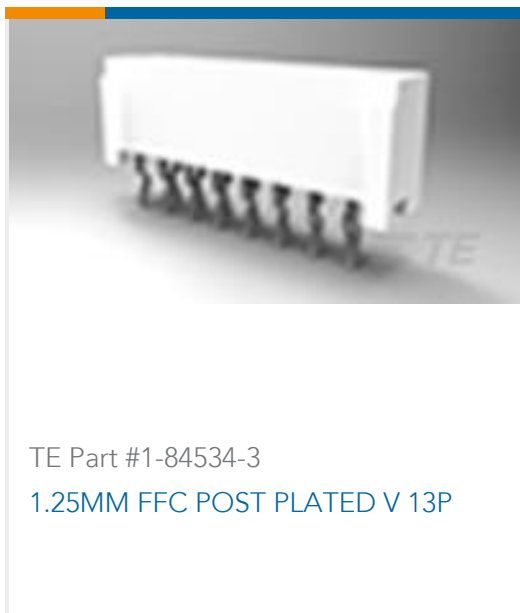
TE Part #1-84534-3 1.25MM FFC POST PLATED V 13P