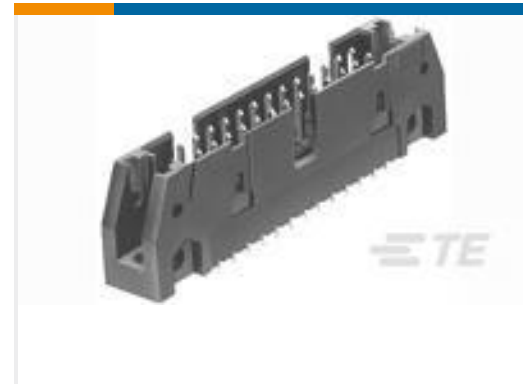
TE Part #102154-4 020 UNIV HDR SP 4S 30DP STD