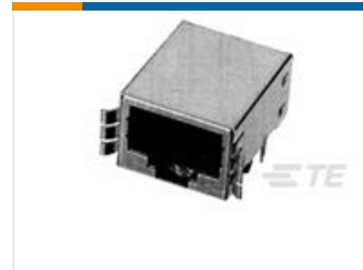
TE Part #1116503-2 MJ,10MM,8P,SHLD,NOPNL TABS,SN