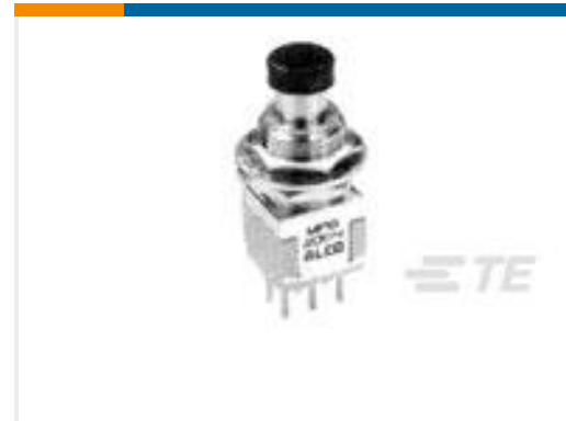
TE Part #5-1437567-3 MPG206R=(MSPG) SW PUSHBUTTON