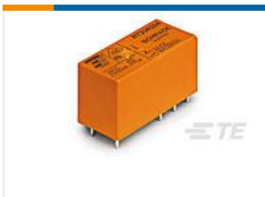
TE Part #6-1393243-8 RT424024