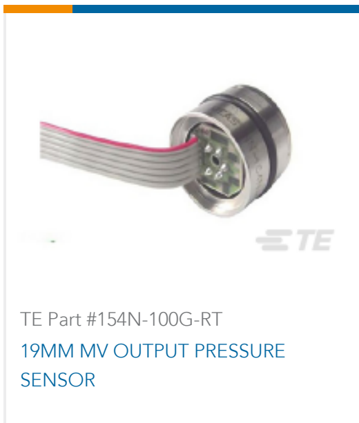
TE Part #154N-100G-RT 19MM MV OUTPUT PRESSURE SENSOR